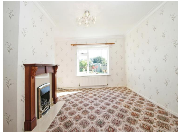
Sycamore Road, Llanharry Pontyclun CF72 9HN