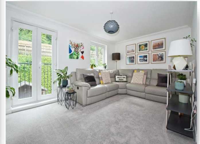
Cadwal Court, Llantwit Fardre Pontypridd CF38 2FA