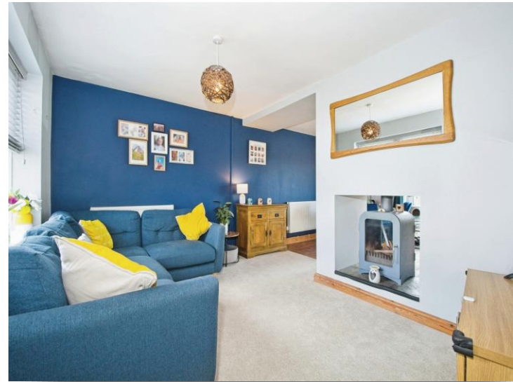
Heol-y-Sarn, Llantrisant PONTYCLUN CF72 8DB