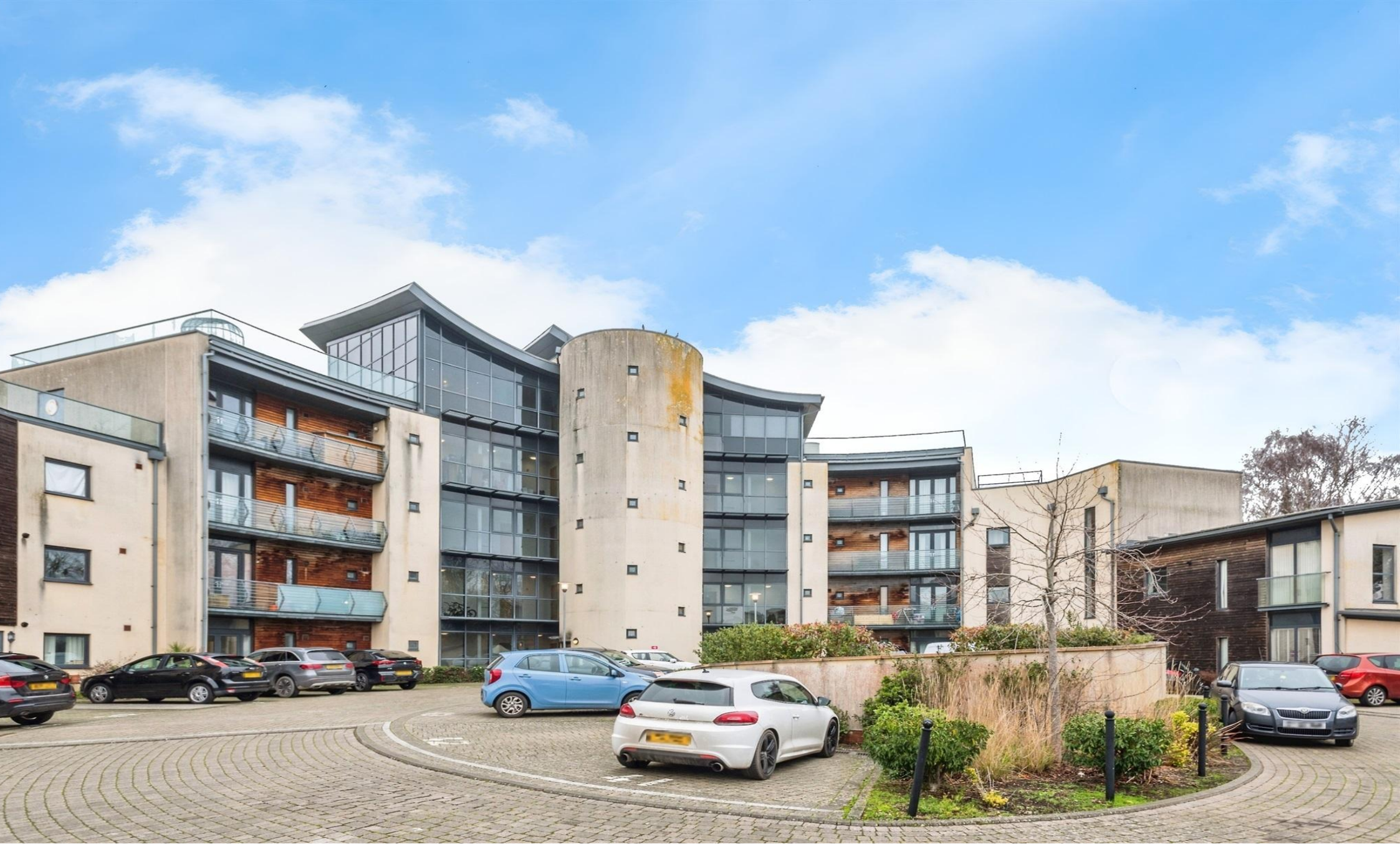
Tunncliffe Close, Swindon SN3 1FP