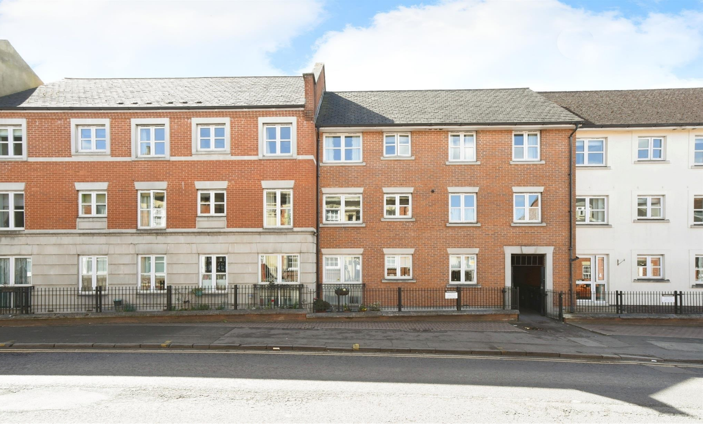
Goddard Court Cricklade Street, Swindon SN1 3LW