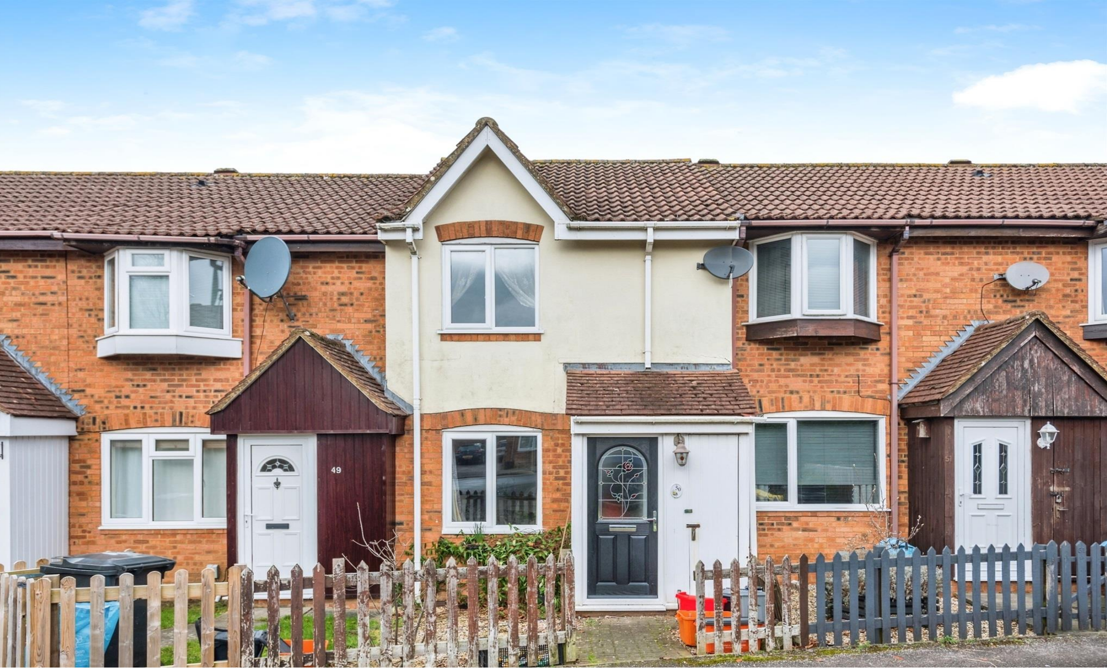
Kimbolton Close, Freshbrook, Swindon SN5 8RE