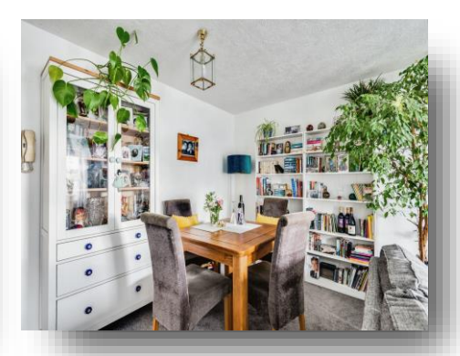
Campridge C. Queens J. Ave