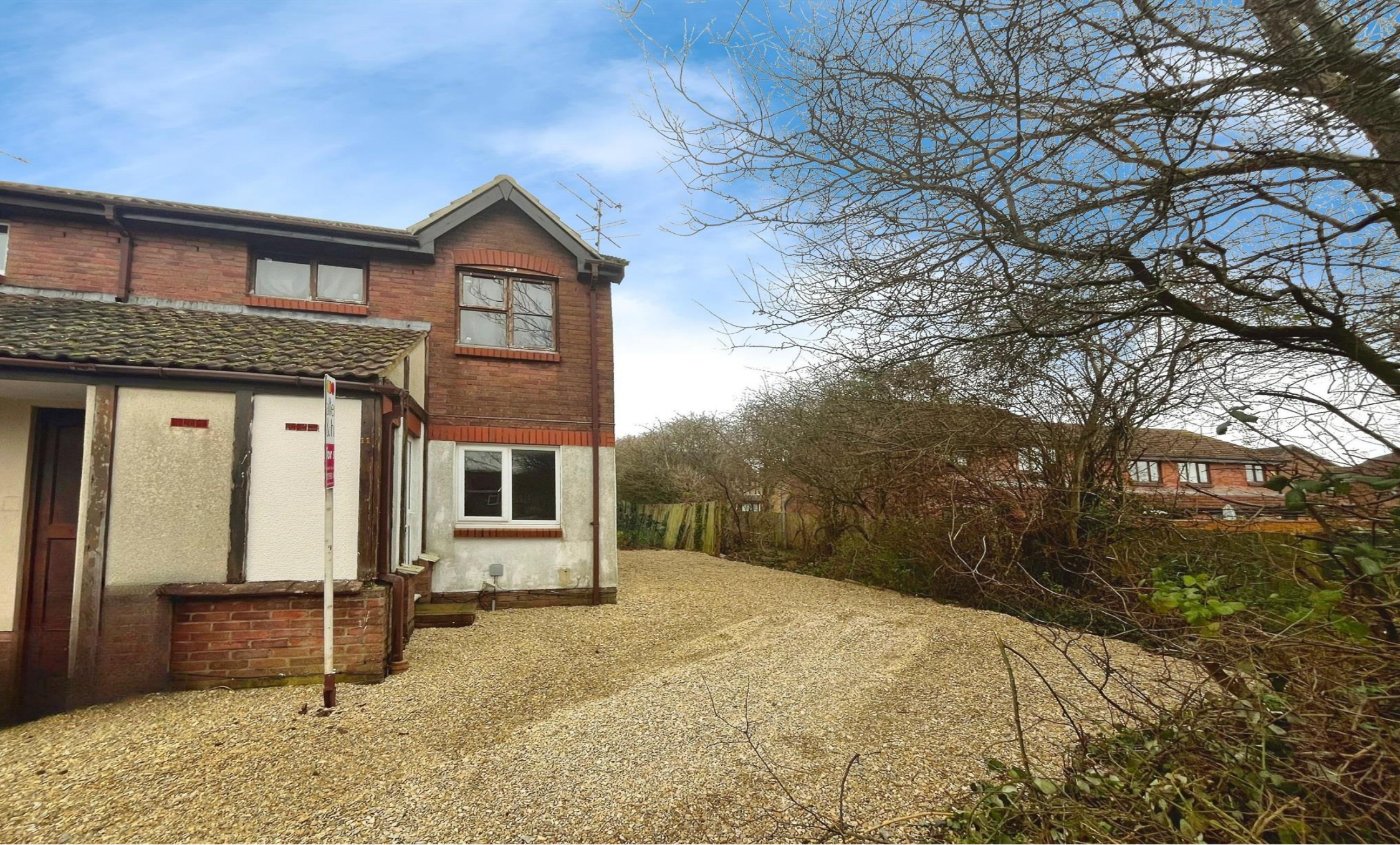
Lucerne Close, Middleleaze Swindon SN5 5GQ