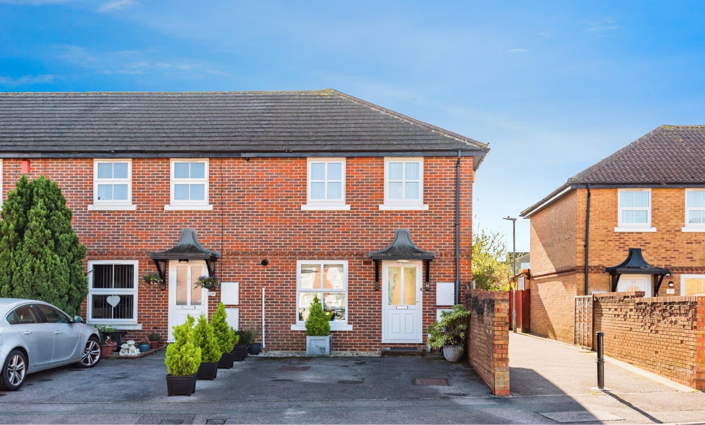
Pasture Close, Swindon SN2 2UH