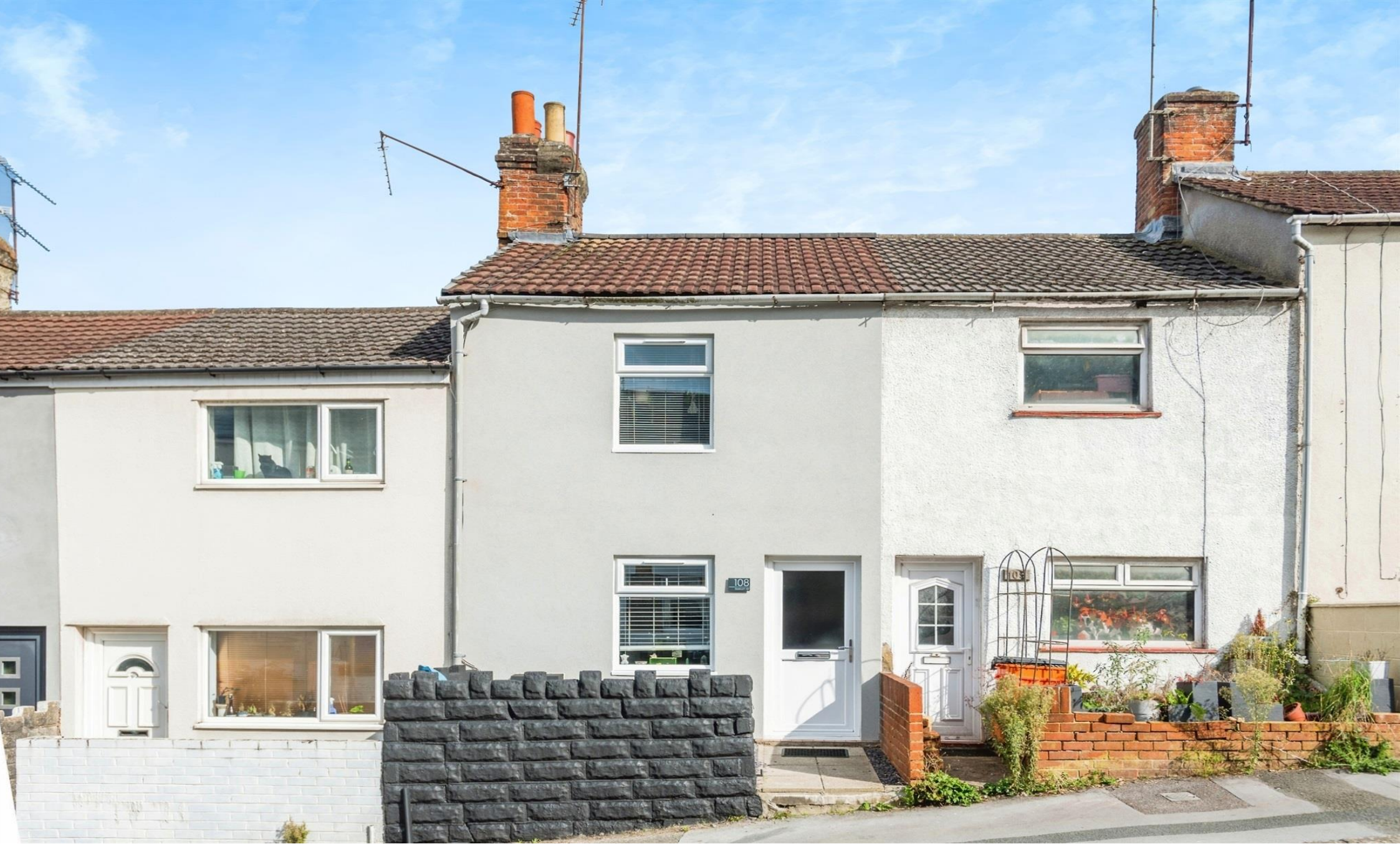
Eastcott Hill, Swindon SN1 3JH