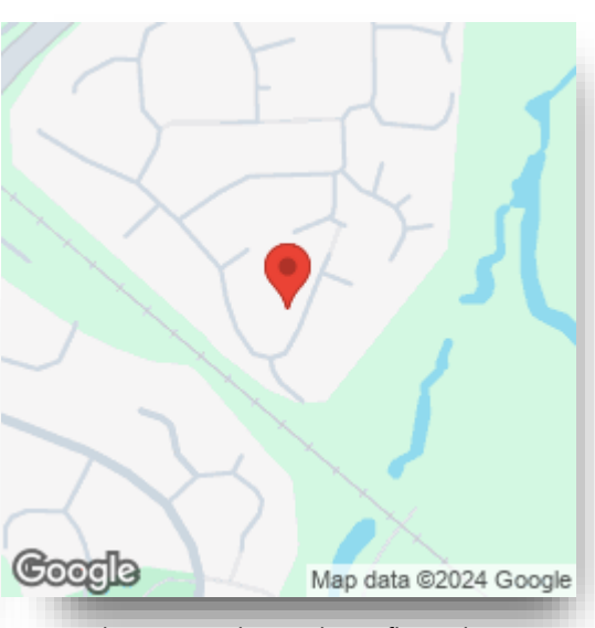
Please note the marker reflects the postcode not the actual property