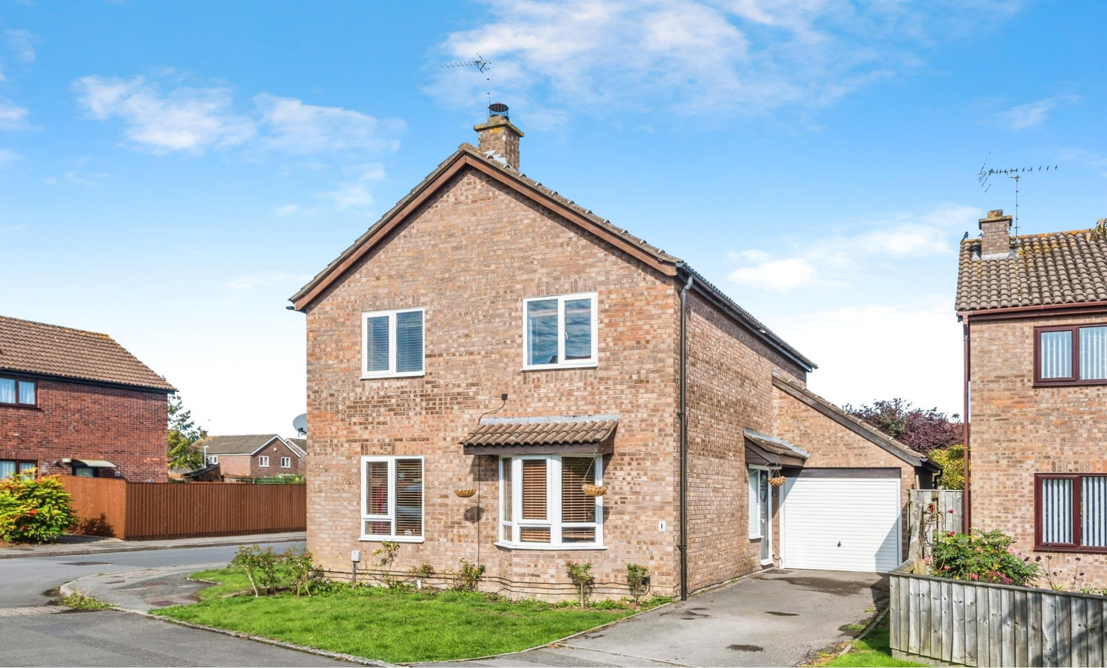
Moresby Close, Westlea Swindon SN5 7BX