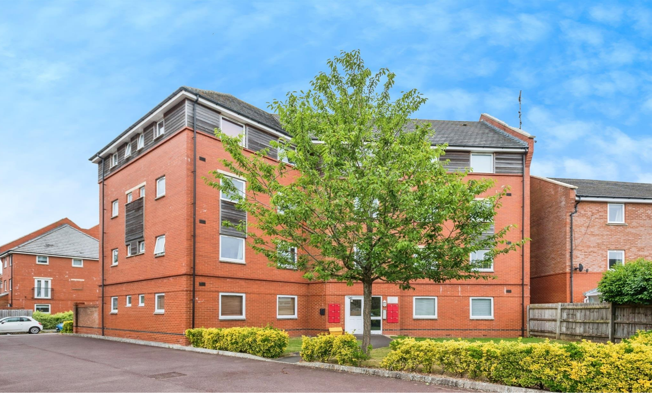
Tustan House Celsus Grove, Swindon SN1 4GS