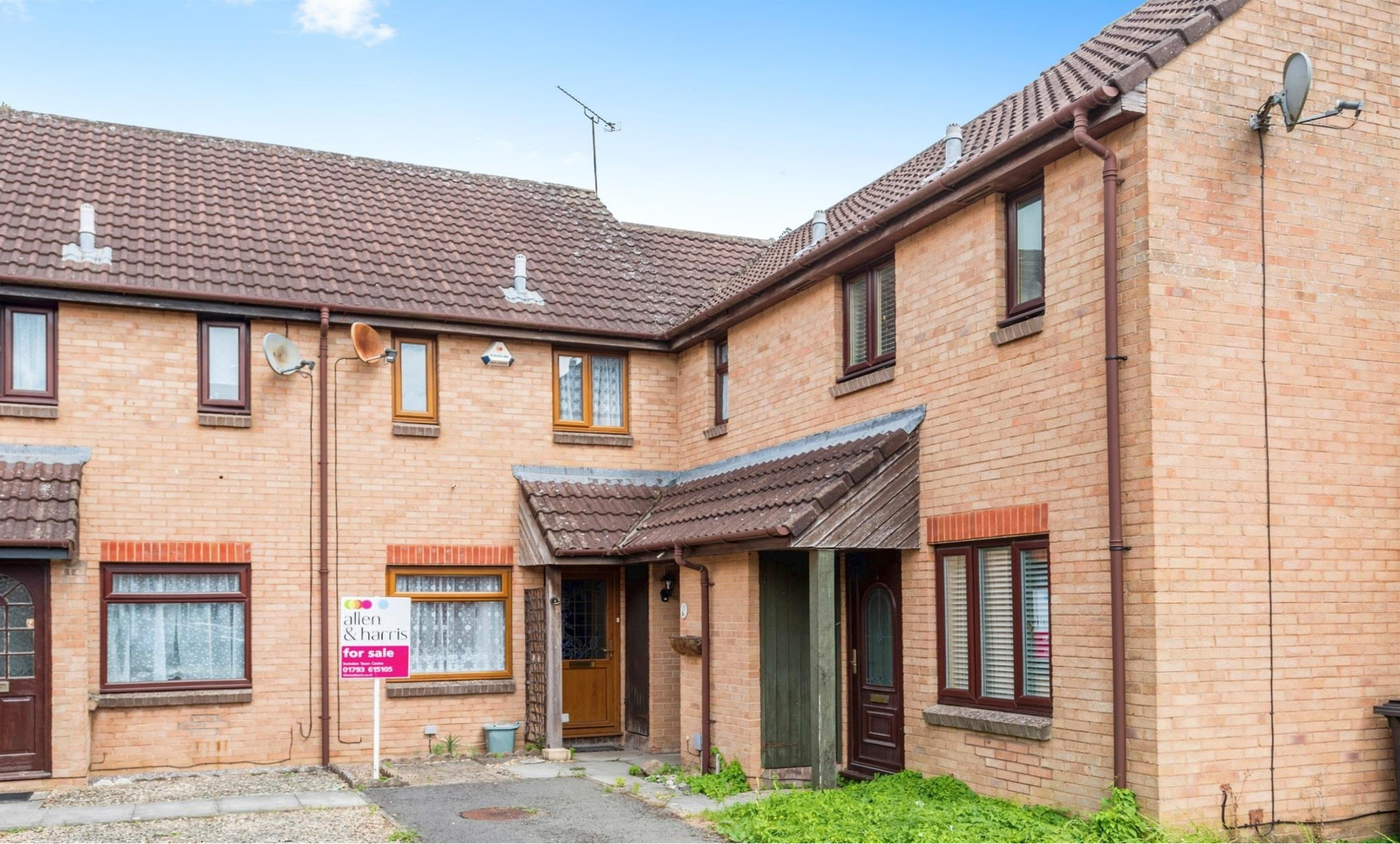
Juliana Close, Middleleaze Swindon SN5 5TA