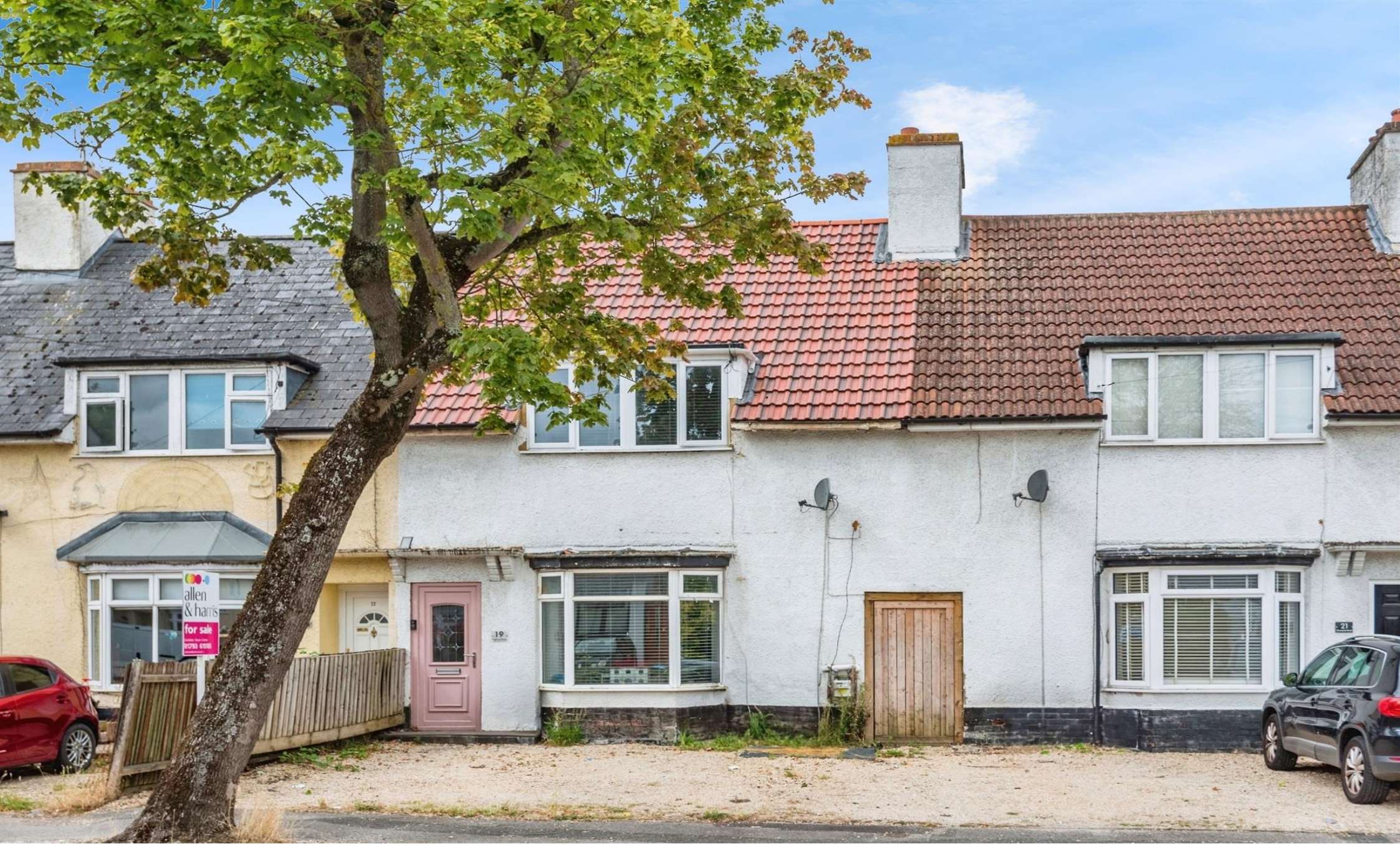
Pinehurst Road, Swindon SN2 1QE