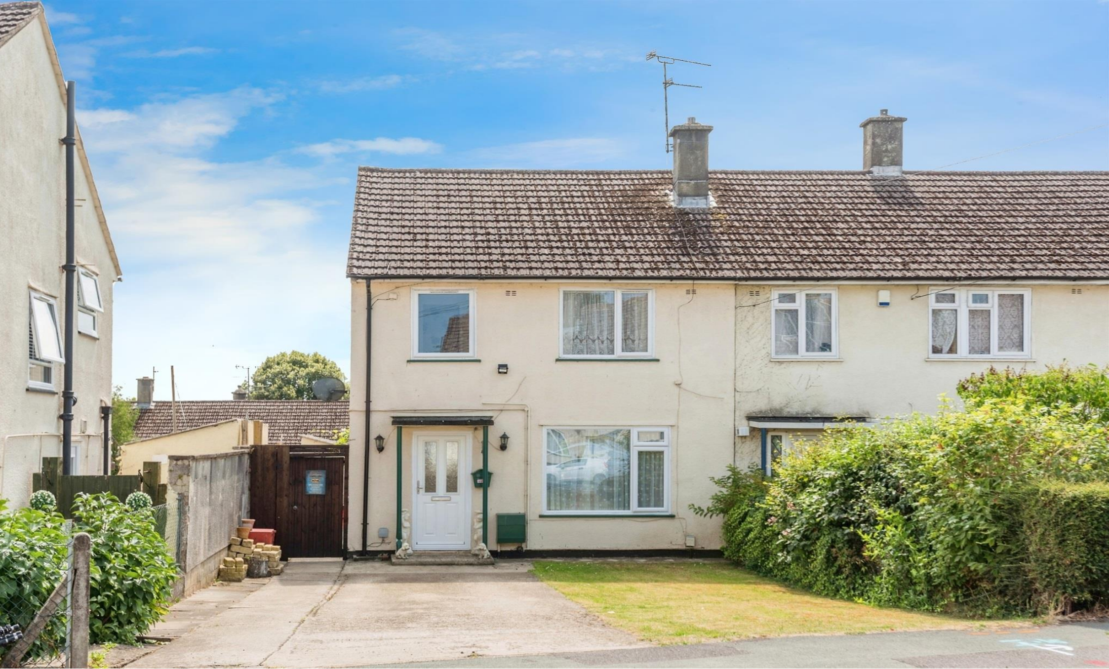
Bourne Road, Swindon SN2 2JN