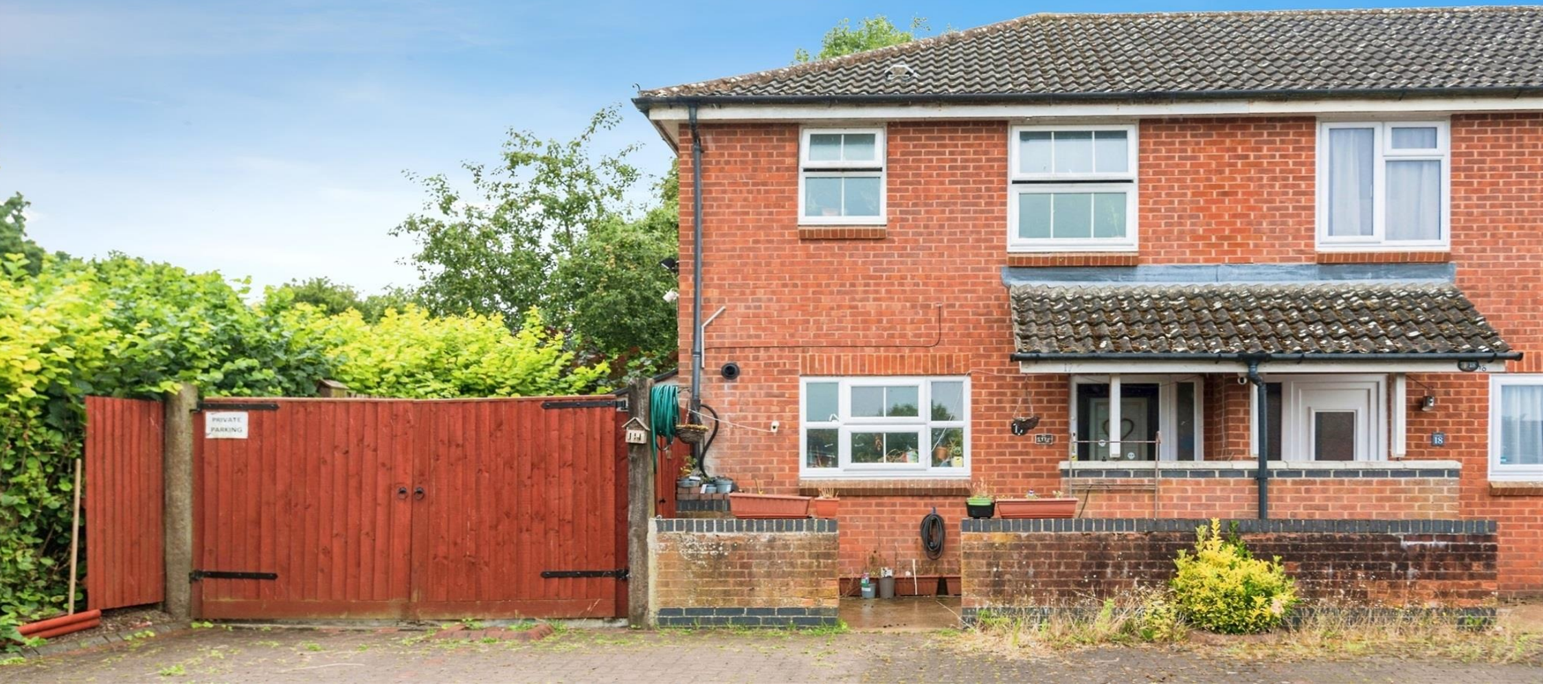
Grandison Close, The Prinnels Swindon SN5 6NB