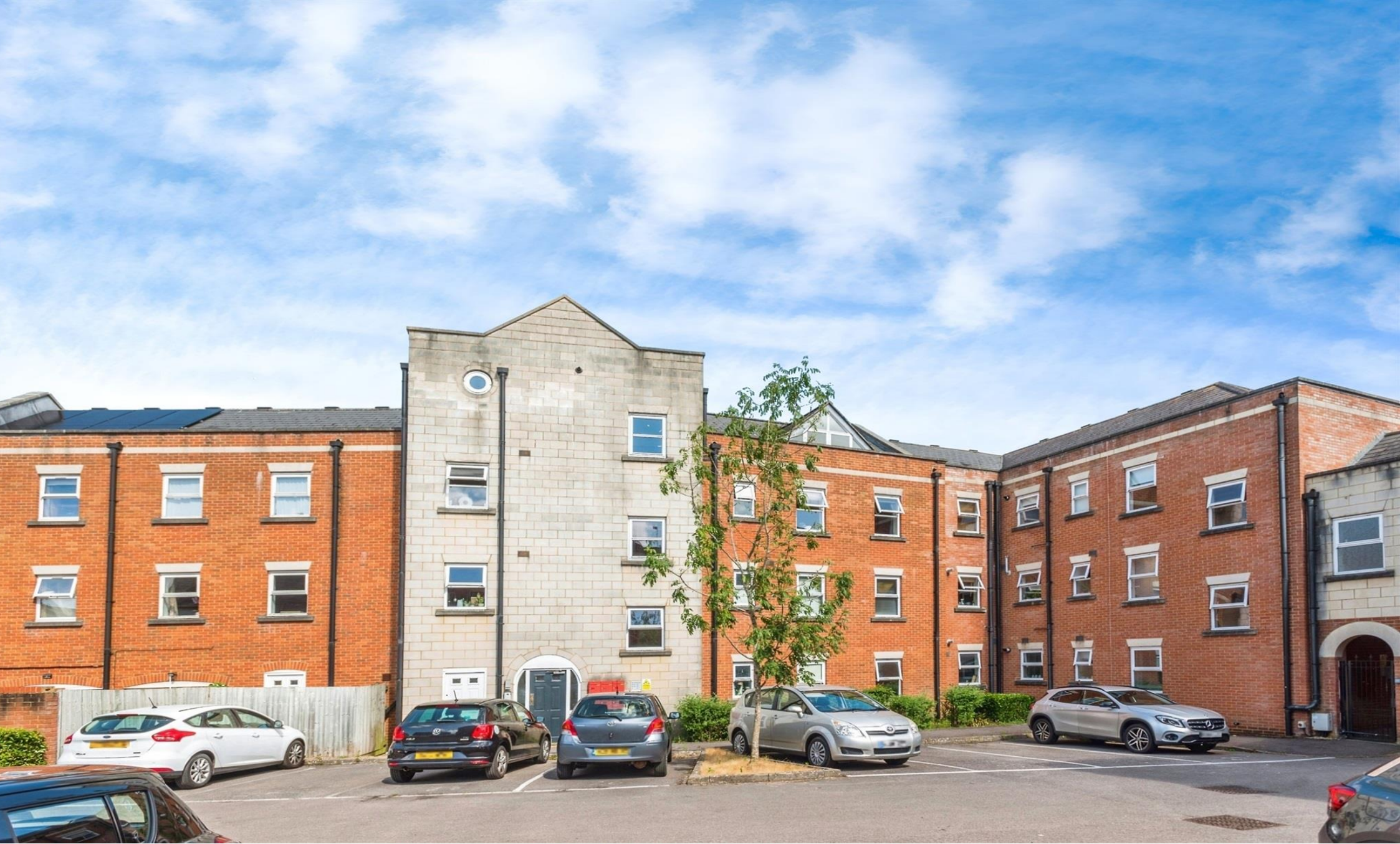
Godwin Court, Swindon SN1 4BB