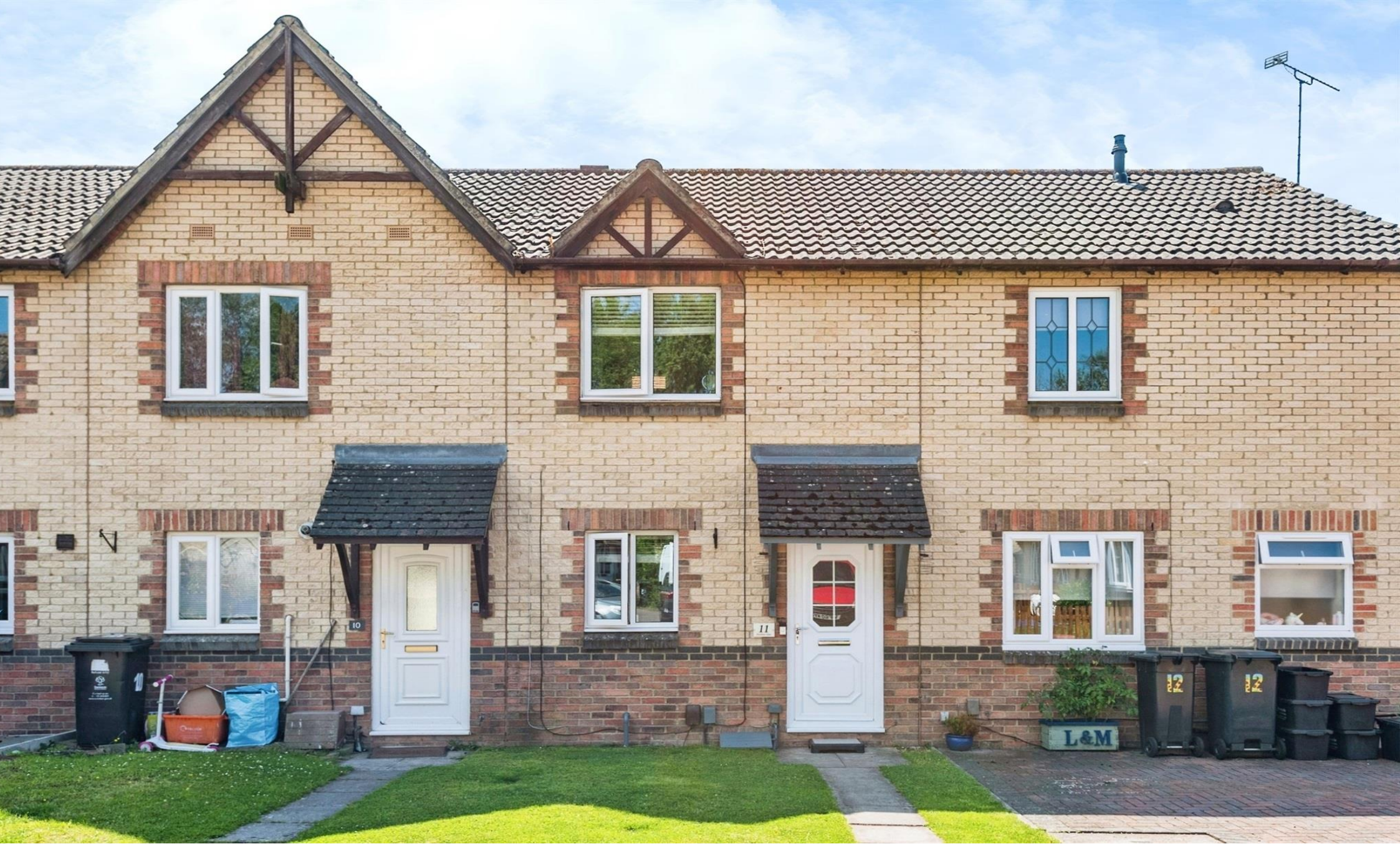
Purslane Close, Swindon SN2 2QS