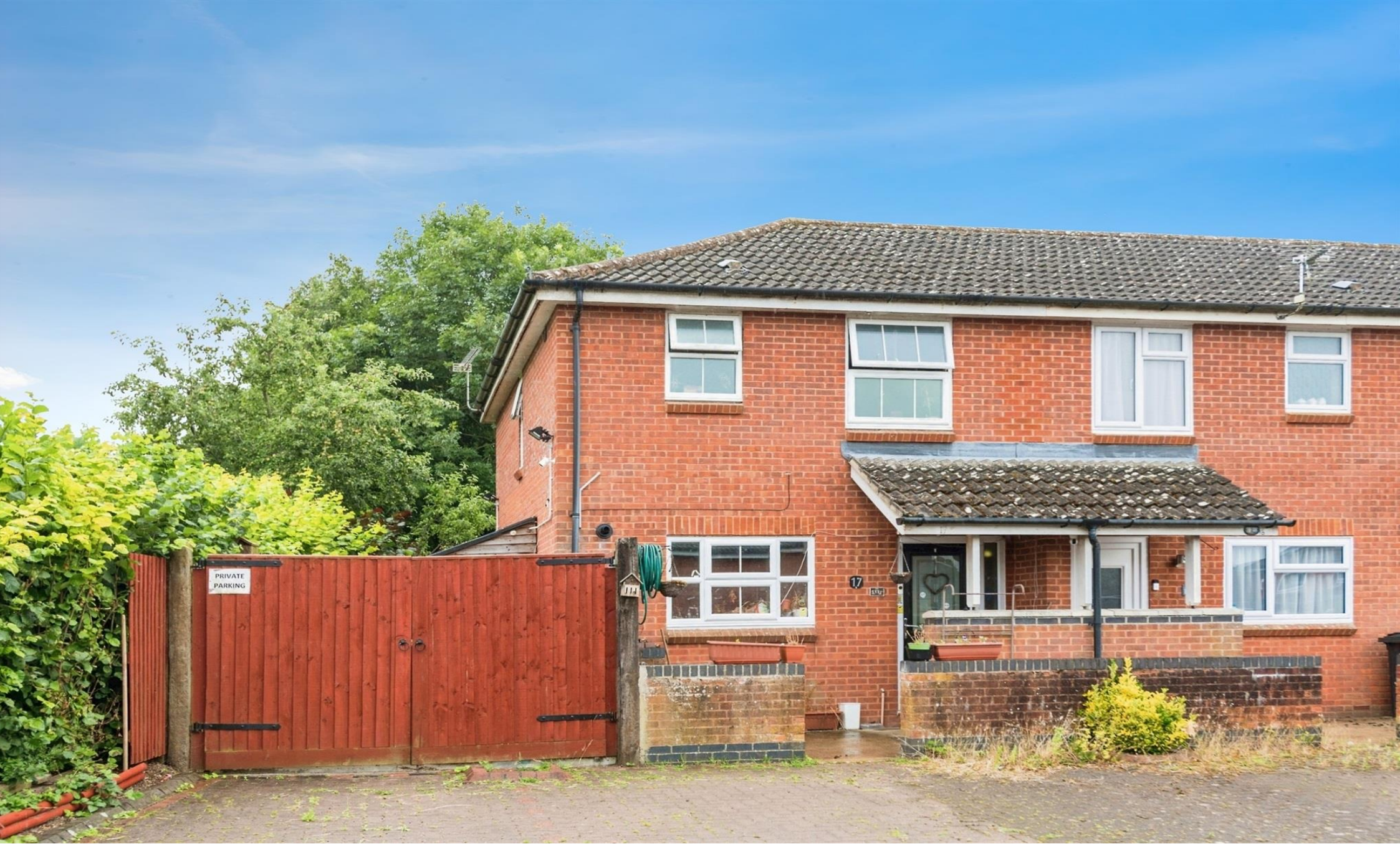
Grandison Close, The Prinnels Swindon SN5 6NB