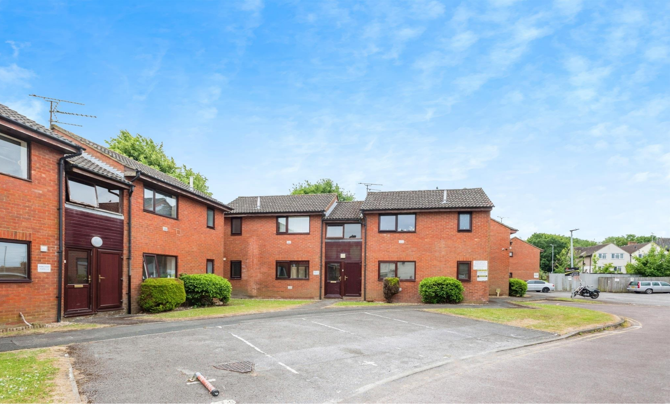
Shire Court, Westcott Place, Swindon, SN1 5HU