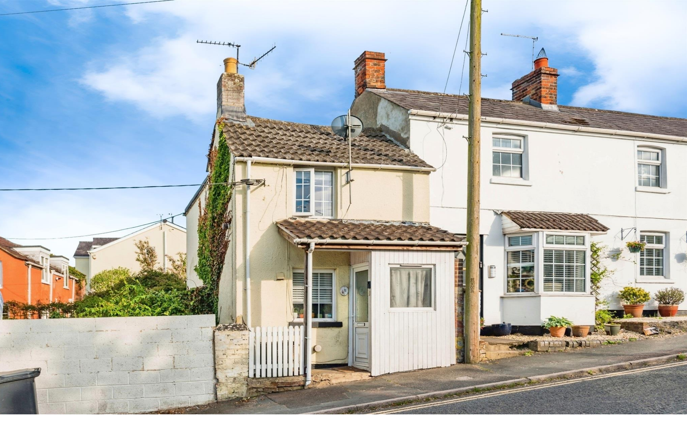
Church Hill, Wroughton Swindon SN4 9JR