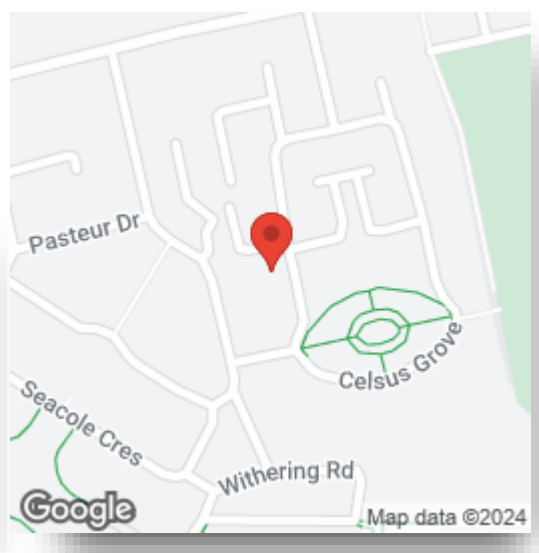
Please note the marker reflects the postcode not the actual property