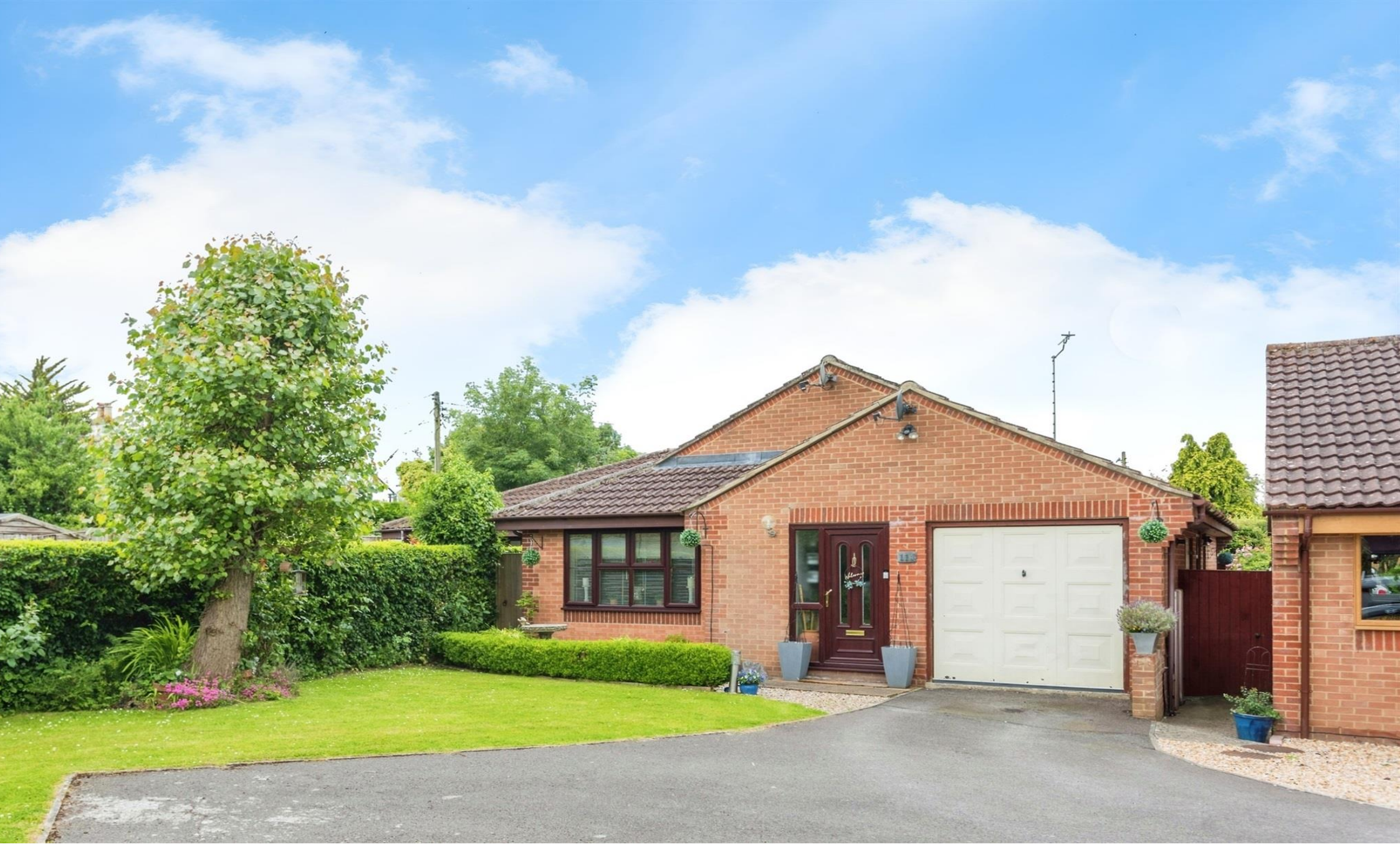
Jersey Park, Shaw Swindon SN5 5QH