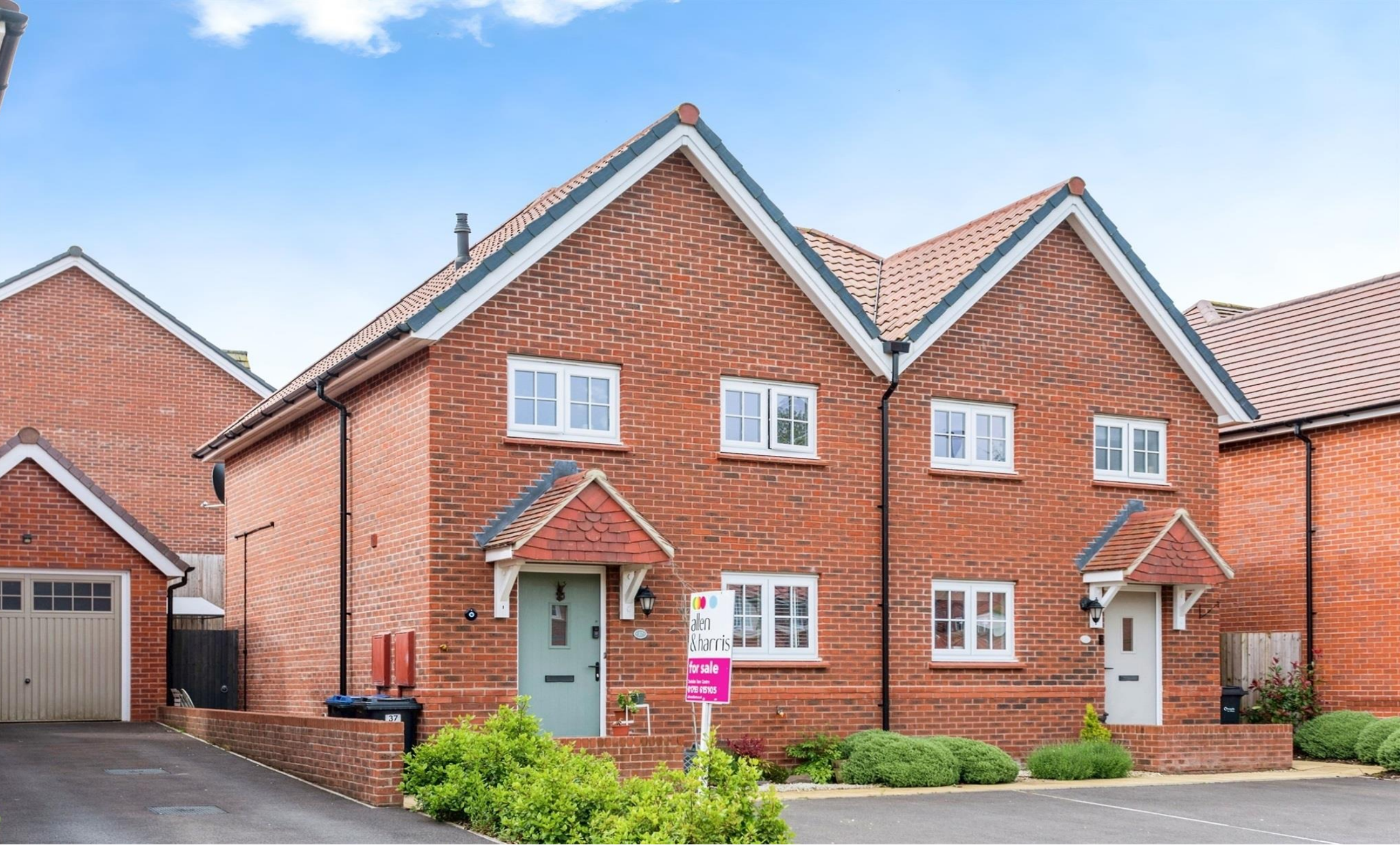
Jennings Road, Marlborough SN8 4WL