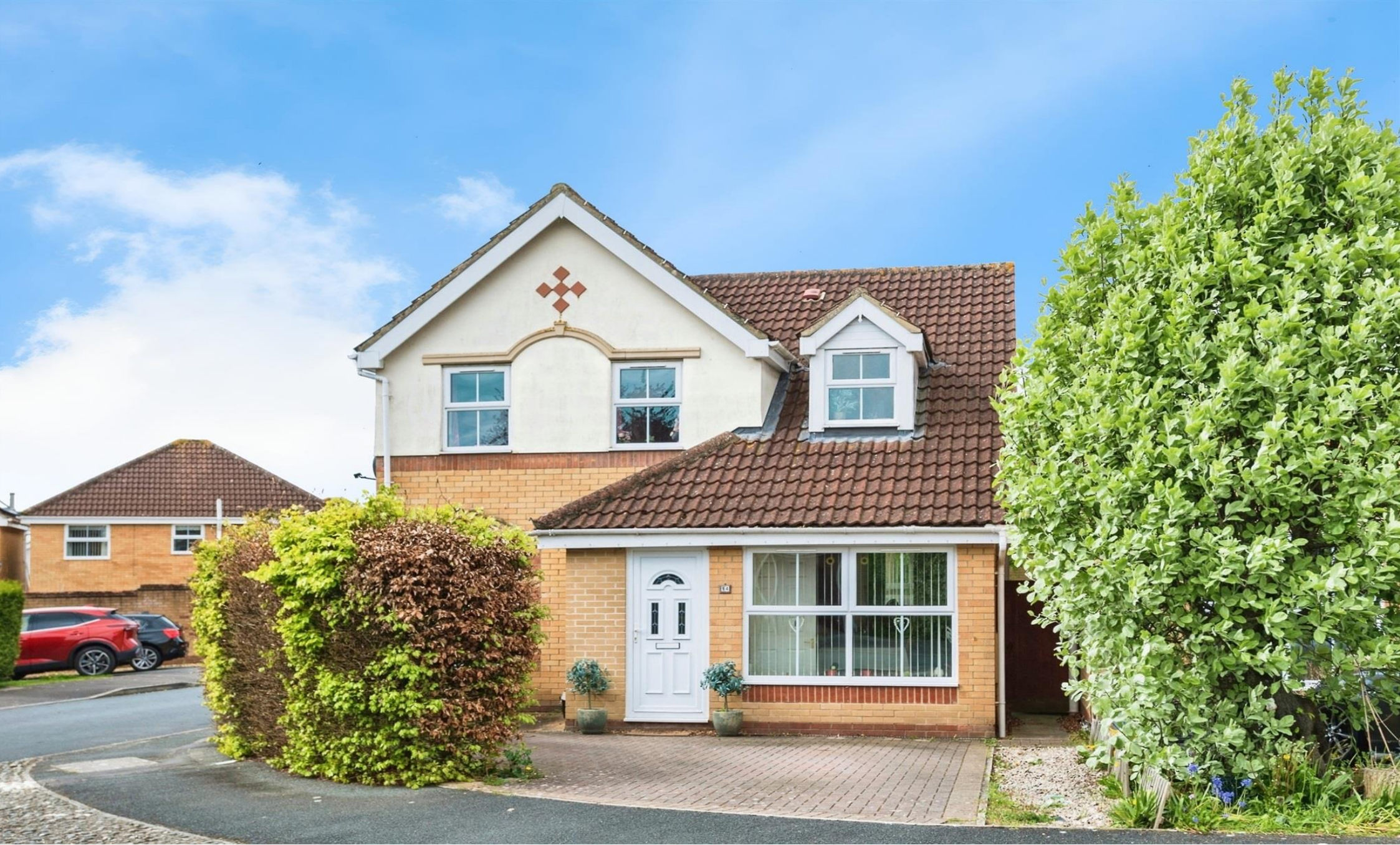
Yeats Close, Swindon SN25 4GT