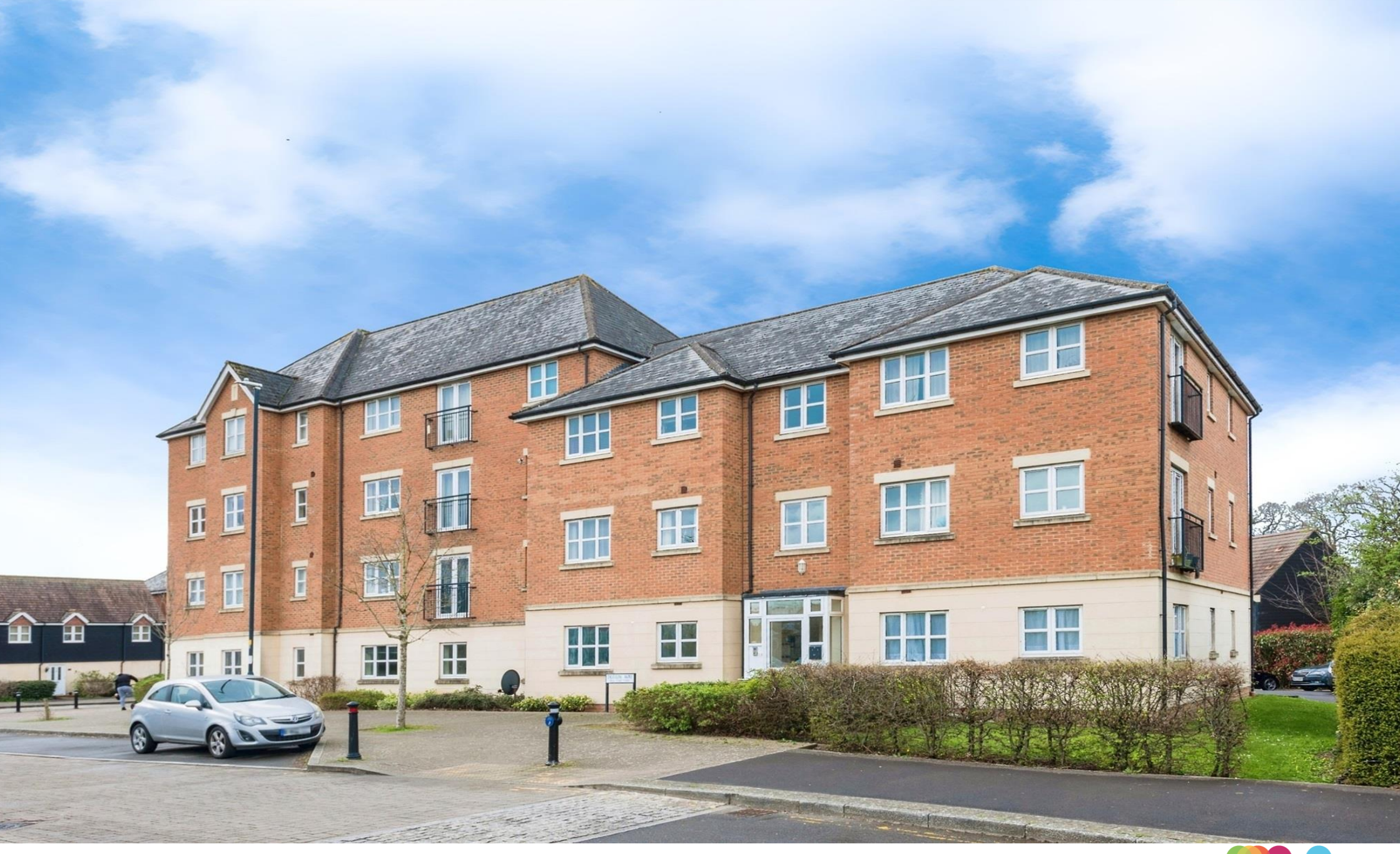
Torun Way, Swindon SN25 1TA