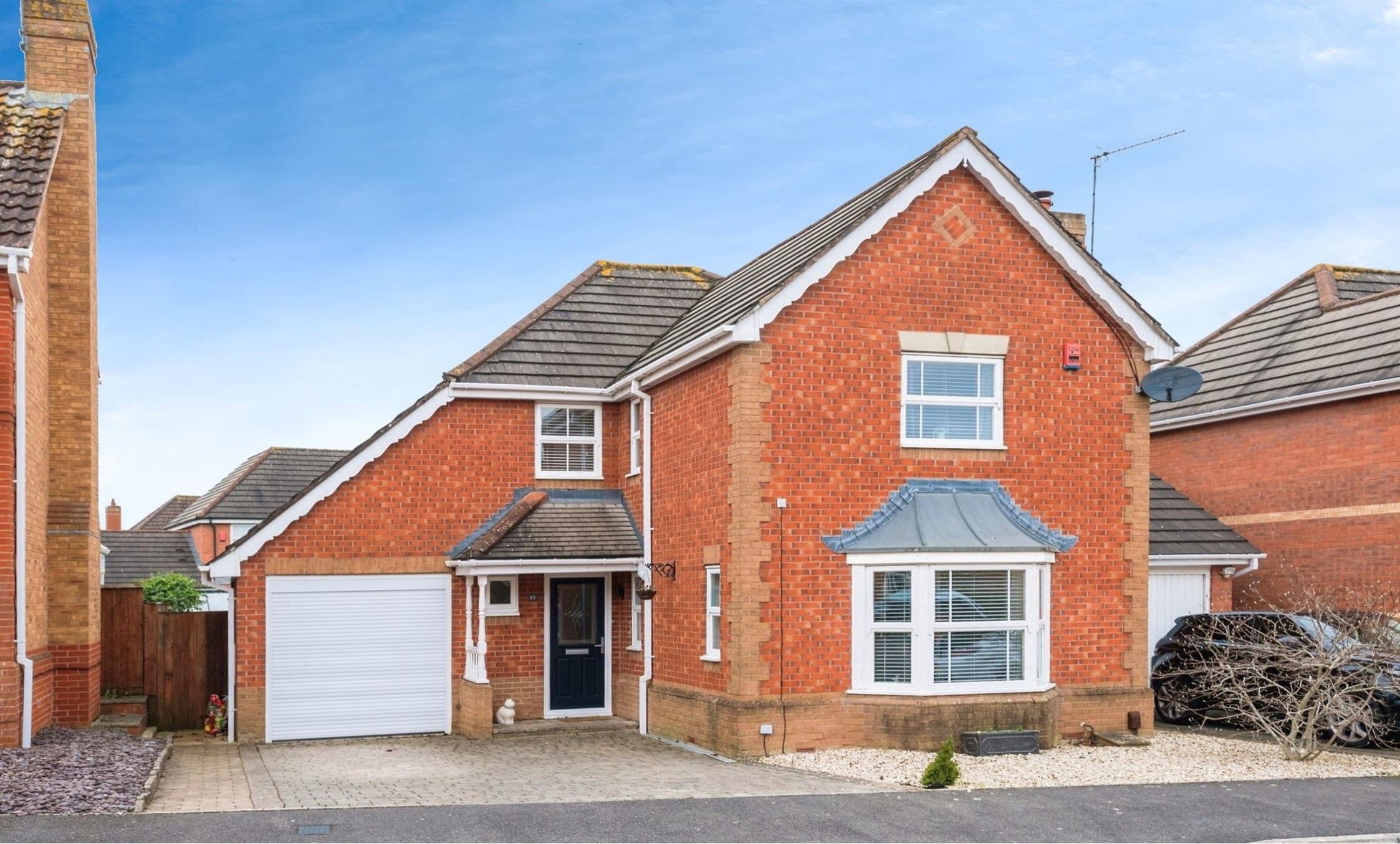
Cranborne Chase, Swindon SN25 1FH