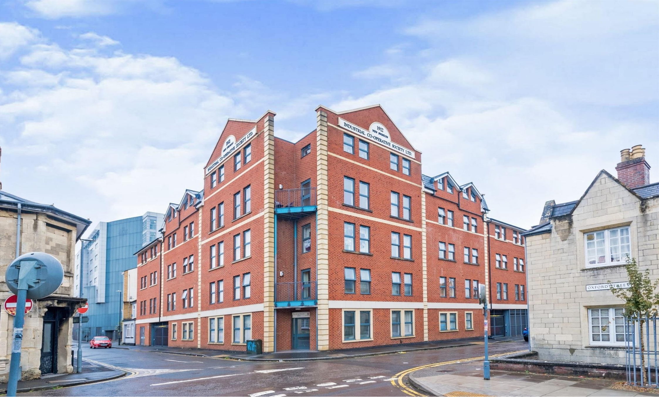
Harding House Harding Street, Swindon SN1 5AF