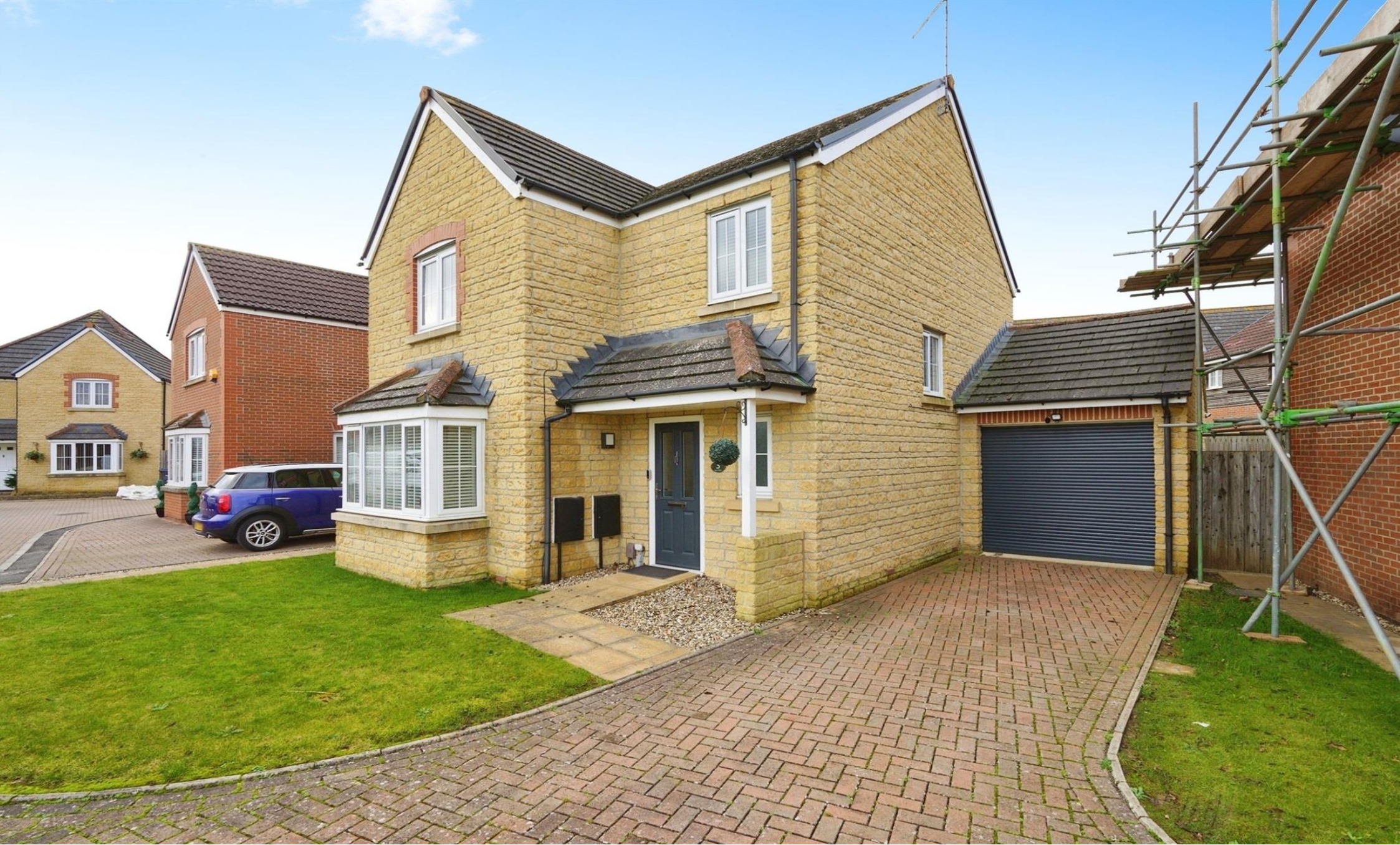
Moulden View Pinto Close, Swindon SN5 5EA