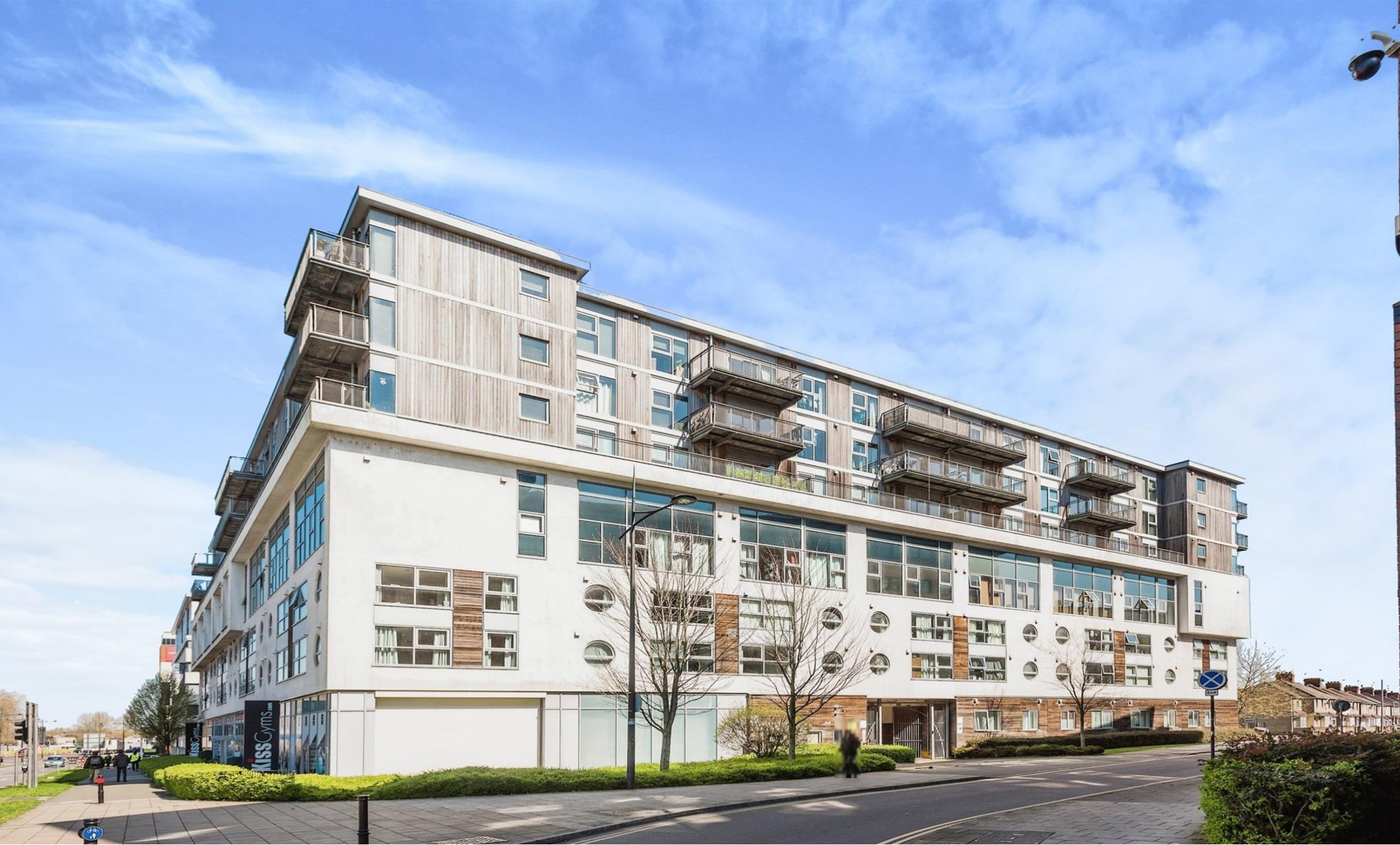
Paramount Beckhampton Street, Swindon SN1 2SE