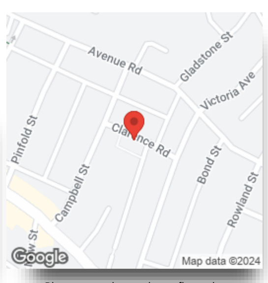
Please note the marker reflects the postcode not the actual property