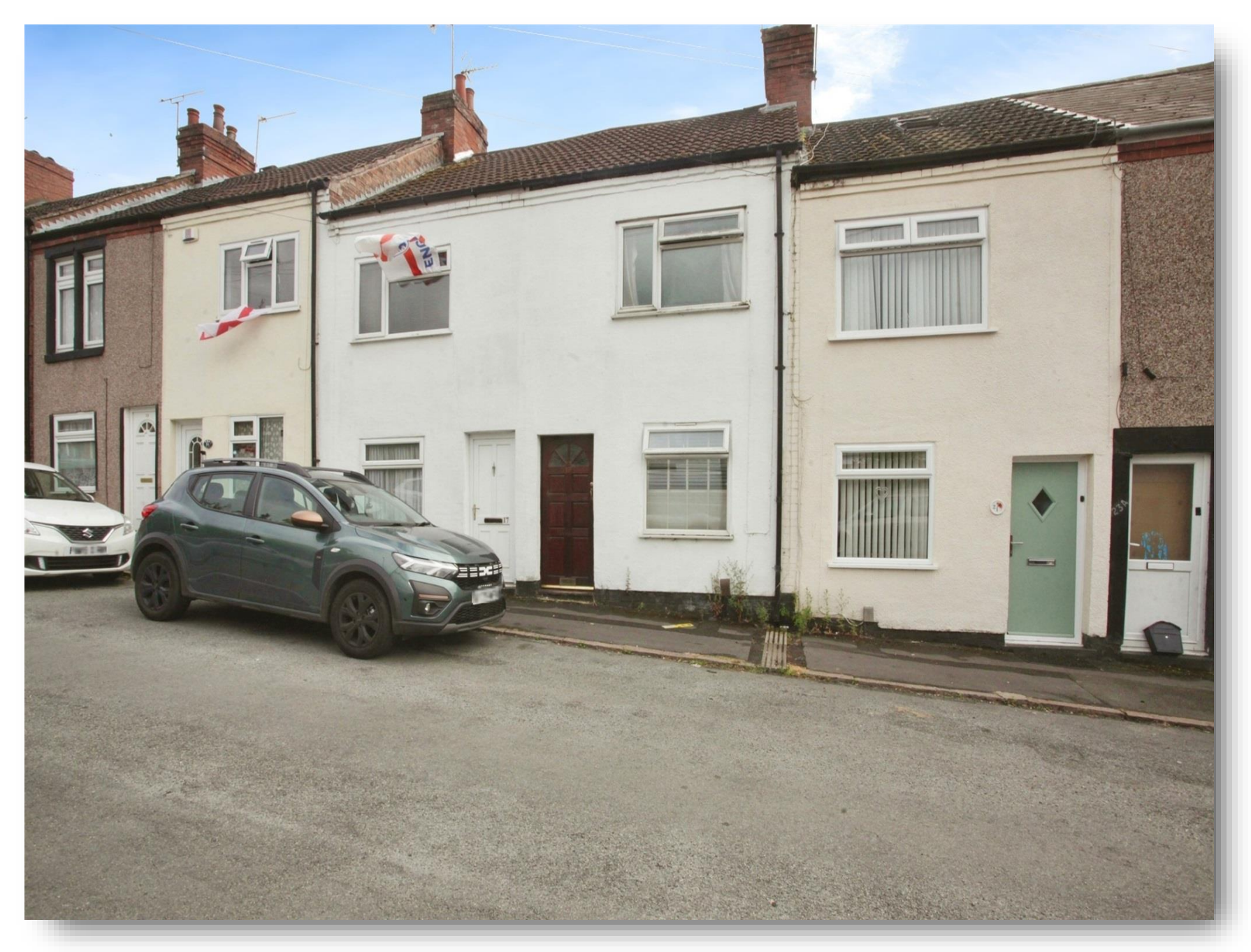
Clarence Road, Rugby, CV21 2JB