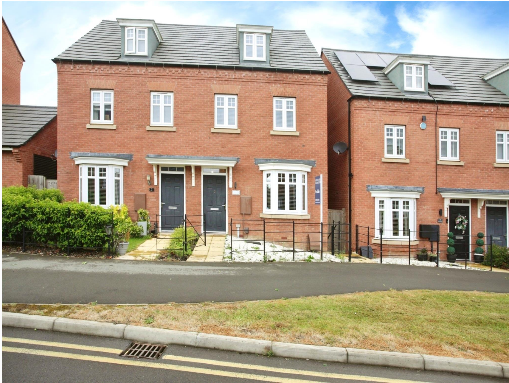
Station Avenue, Houlton, Rugby, CV23 1BF