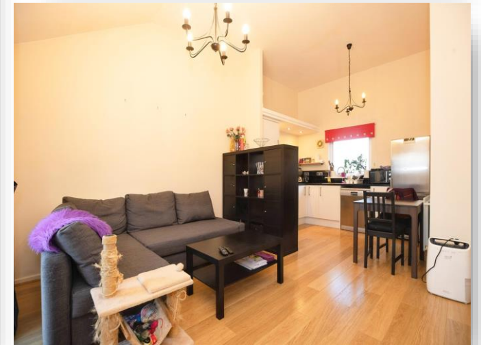
Follager Road, Rugby CV21 2HF