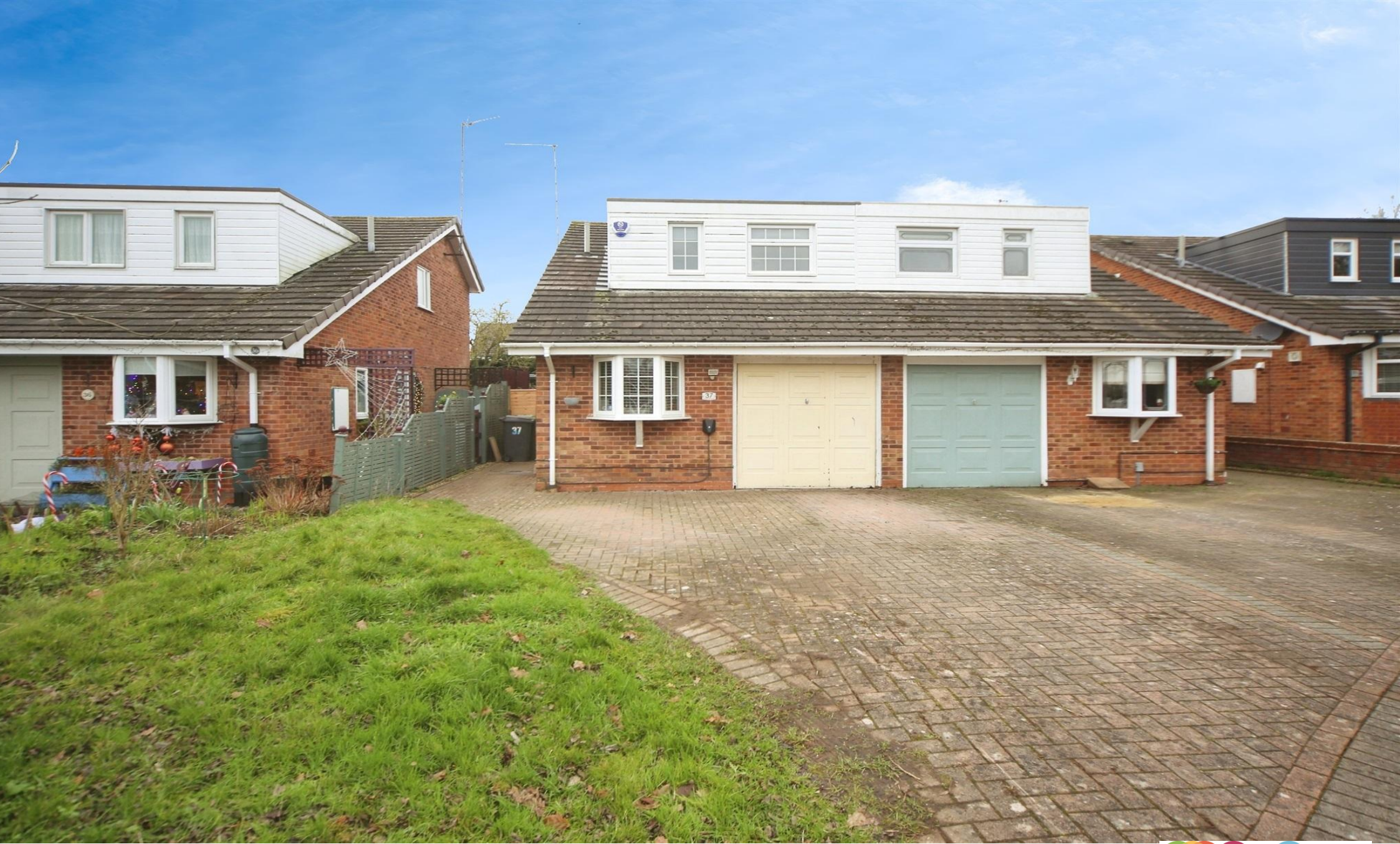
Kingscote Close, Redditch B98 9LJ