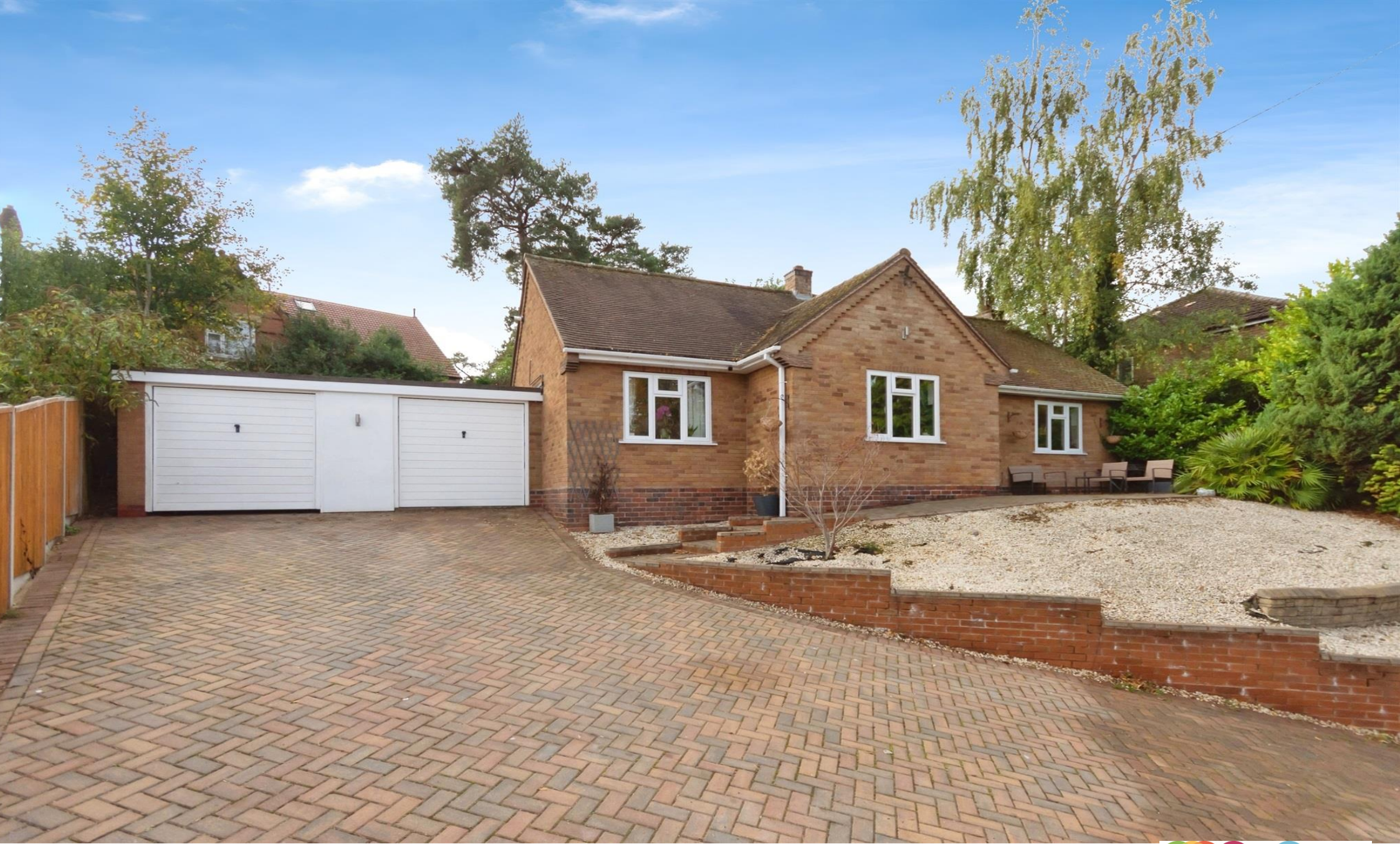
Lindridge The Mayfields, Redditch B98 7DU