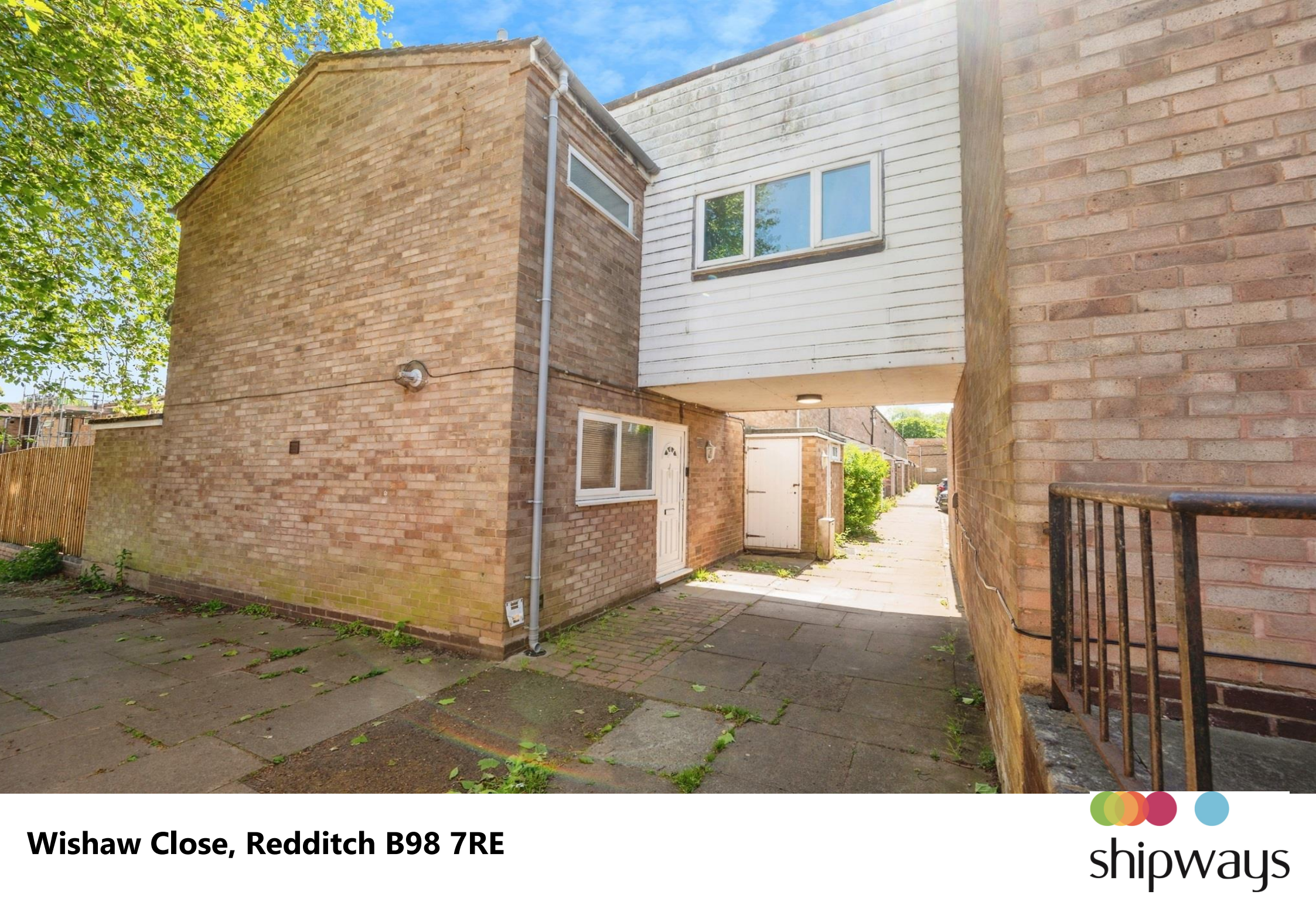
Wishaw Close, Redditch B98 7RE