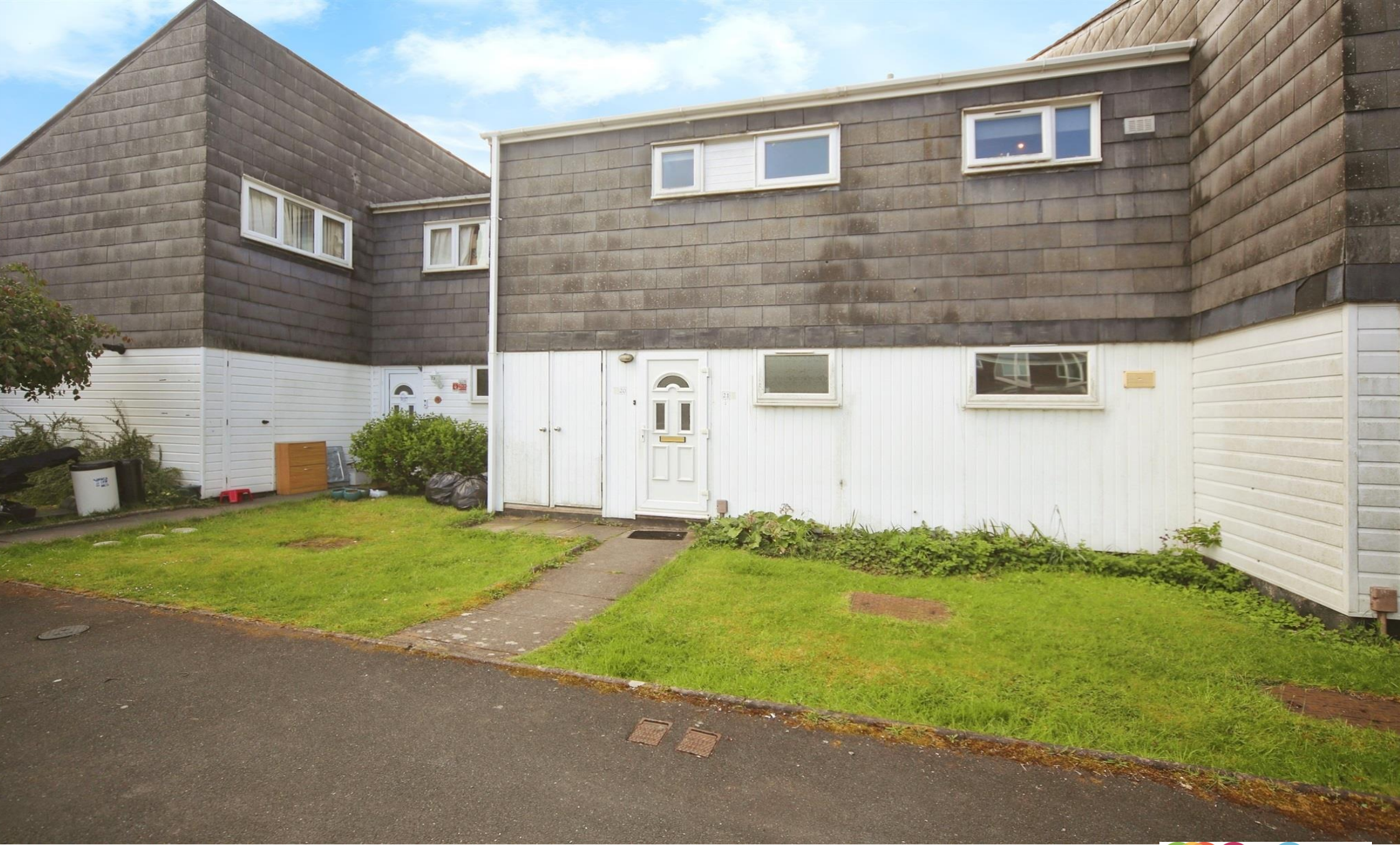
Ryton Close, Redditch B98 0EW