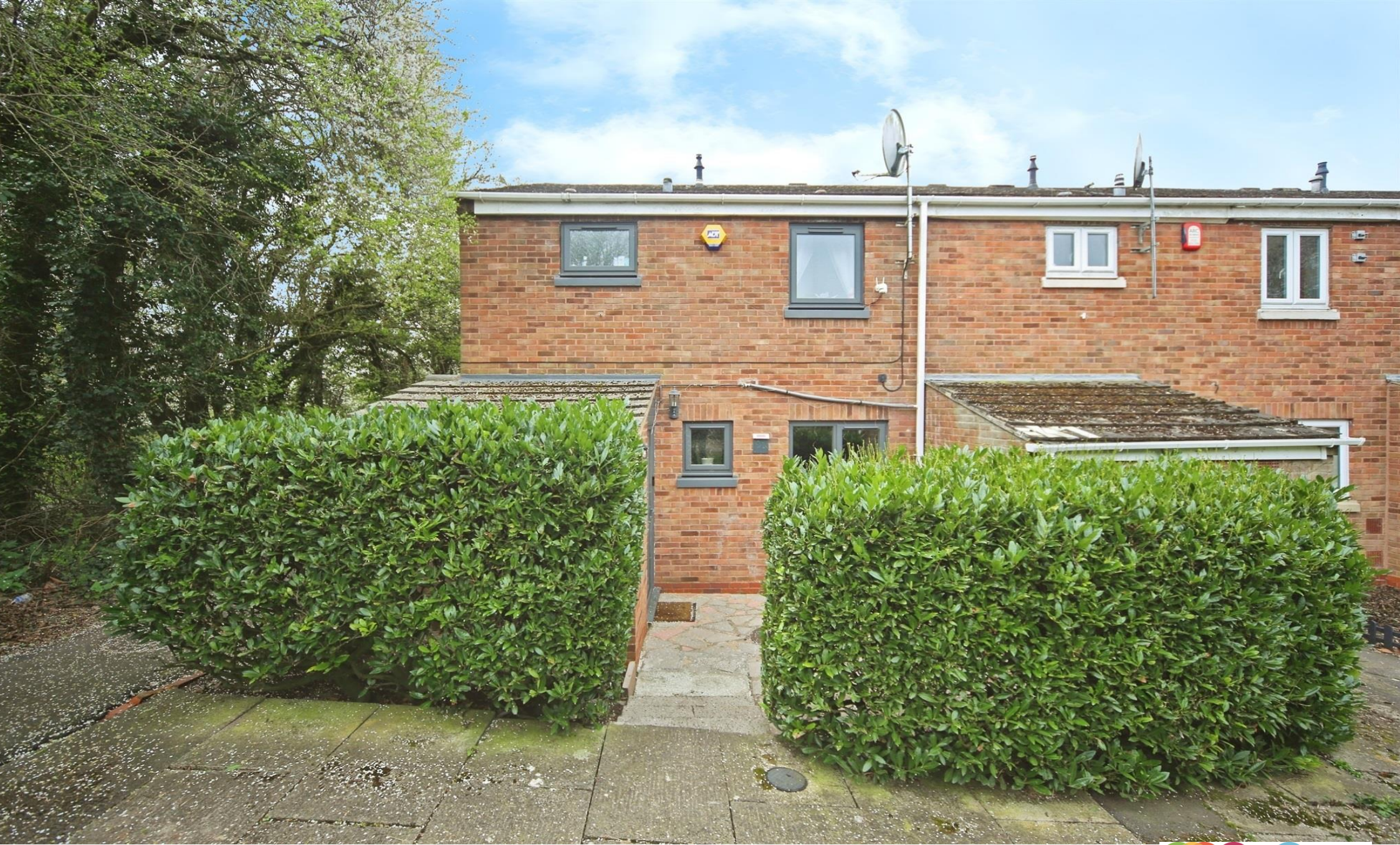
Northleach Close, Redditch B98 8RB