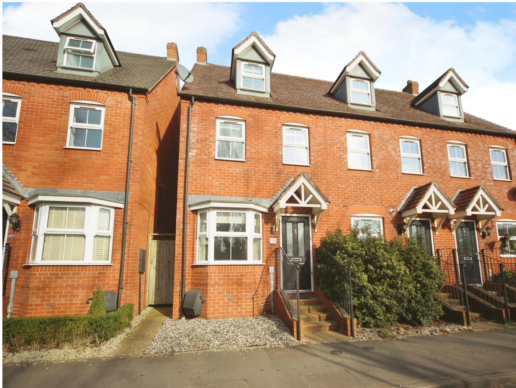
Warwick Road, Henley-In-Arden B95 5BH