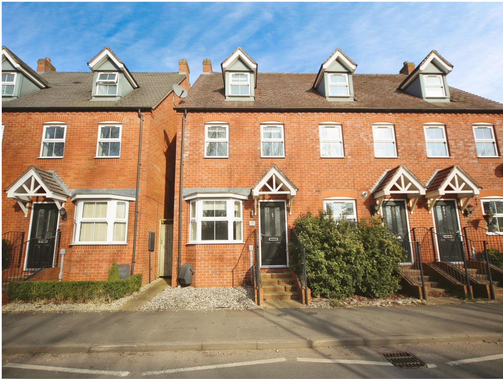
Warwick Road, Henley-In-Arden B95 5BH