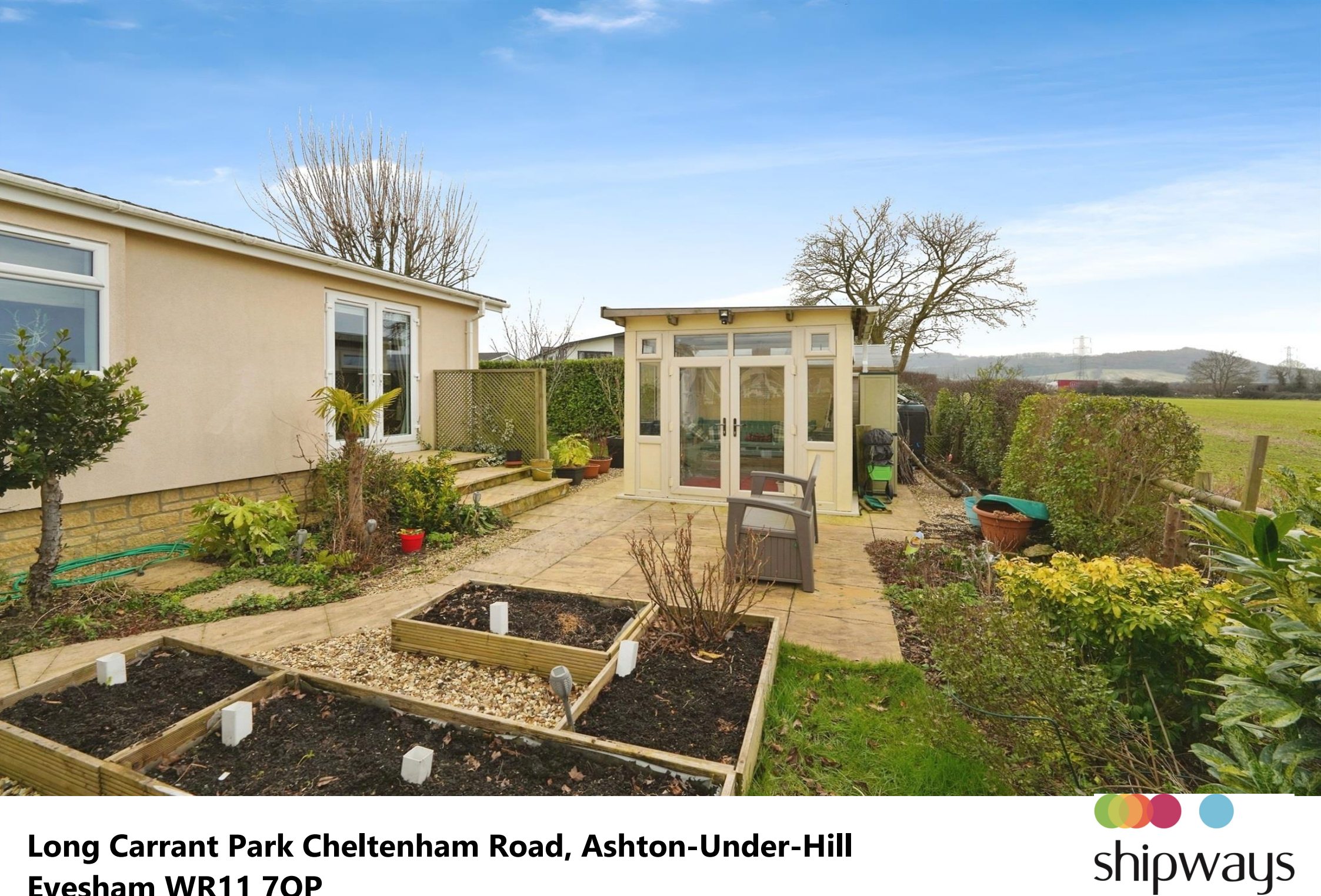
Long Carrant Park Cheltenham Road, Ashton-Under-Hill Evesham WR11 7QP