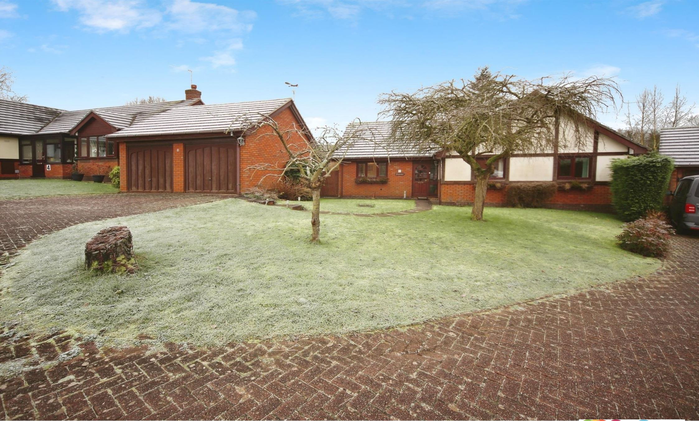
Woodgreen Close, Callow Hill Redditch B97 5YR