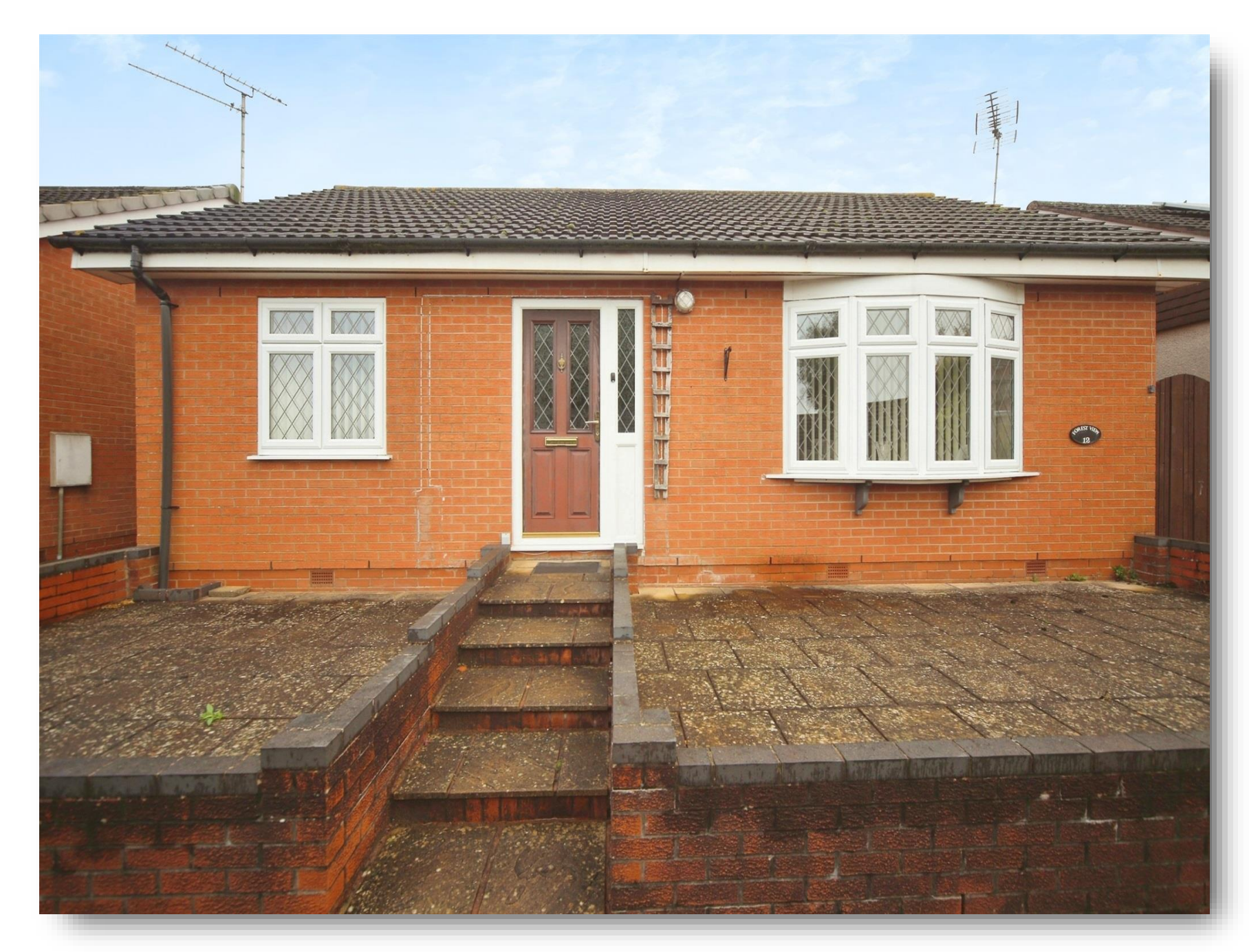
Forest View, Redditch B97 5LA