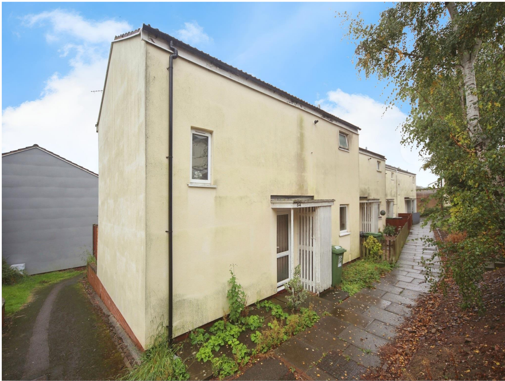
Winforton Close, Redditch B98 0JX