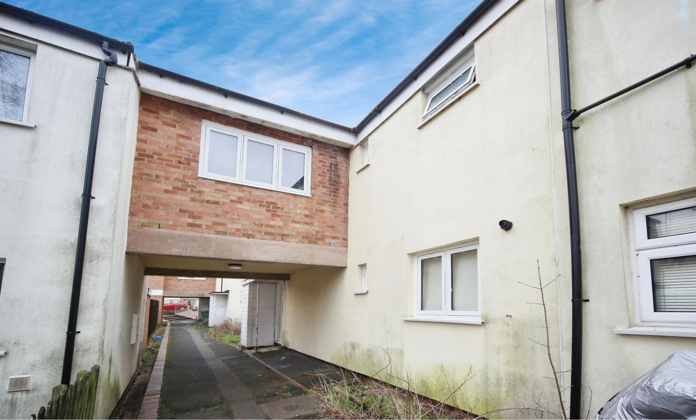
Ombersley Close, Redditch B98 7UU