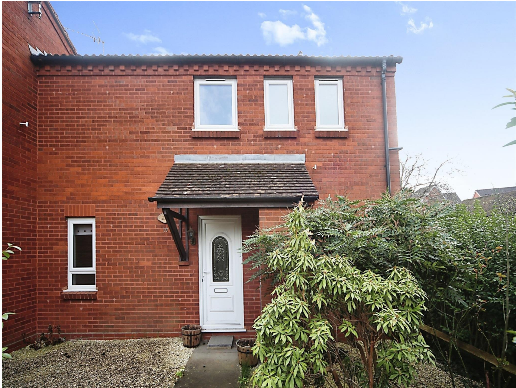
Mill Street, Redditch B97 4BU