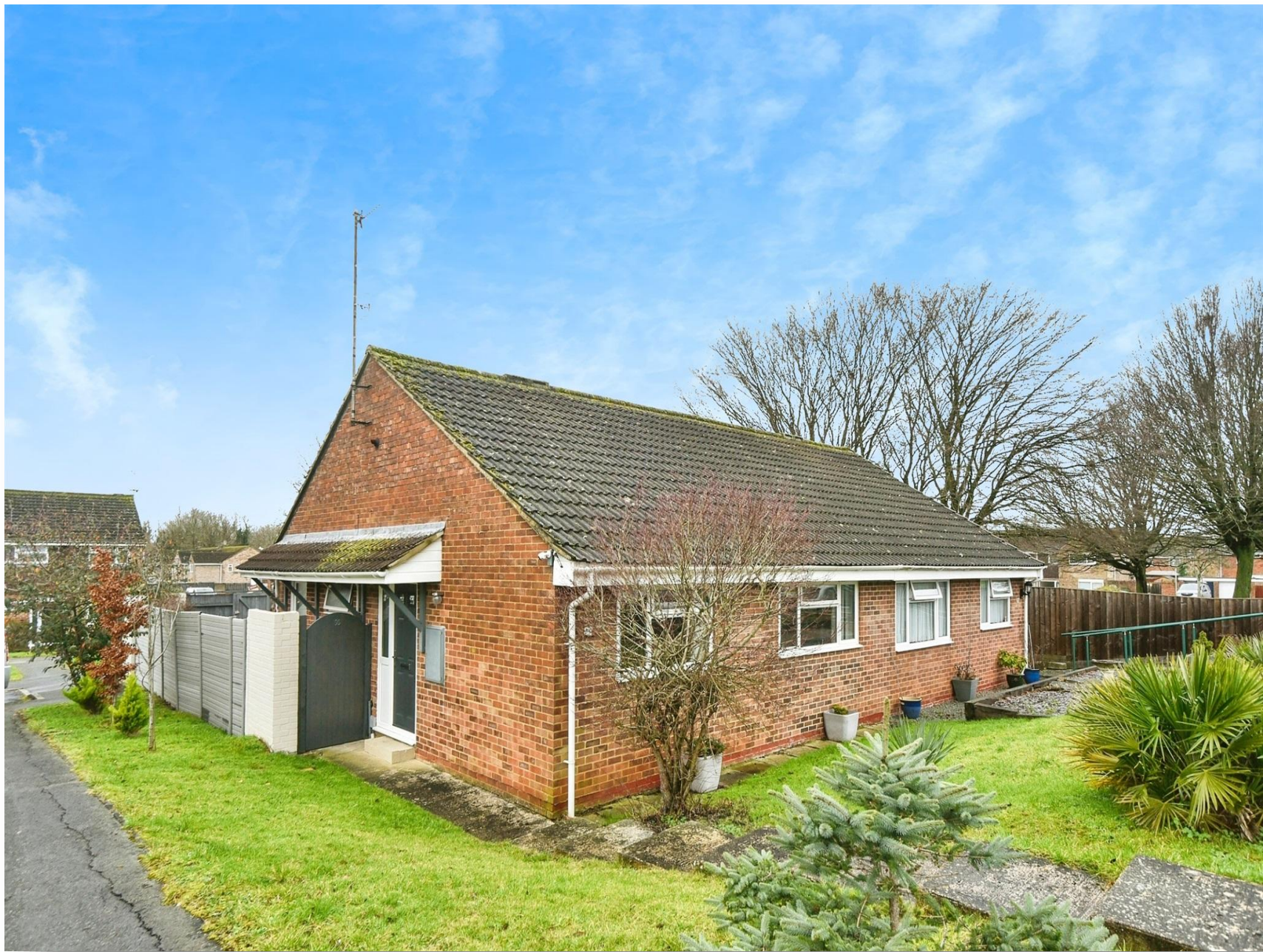
Bevisland, SWINDON SN3 6AN