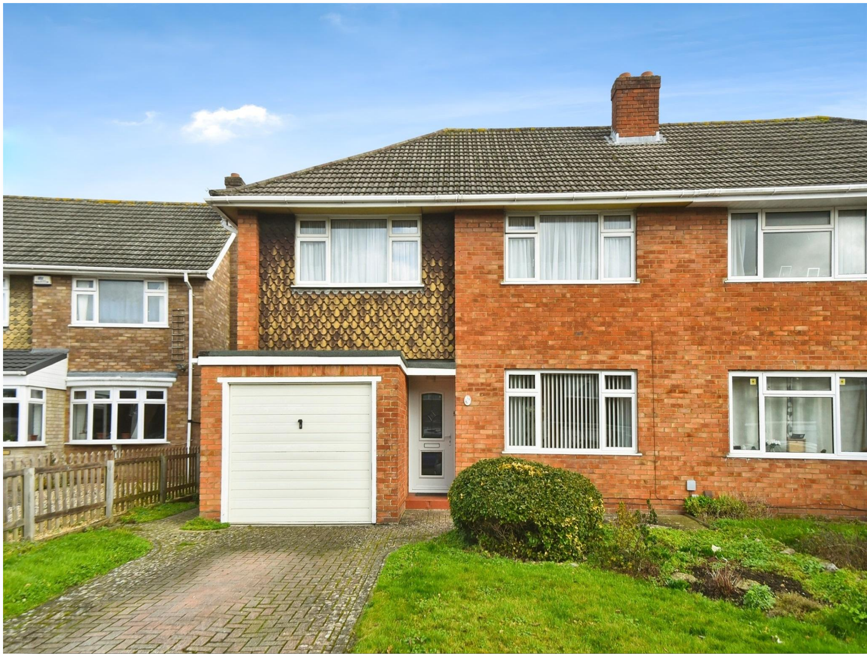
Cloche Way, Swindon SN2 7JN