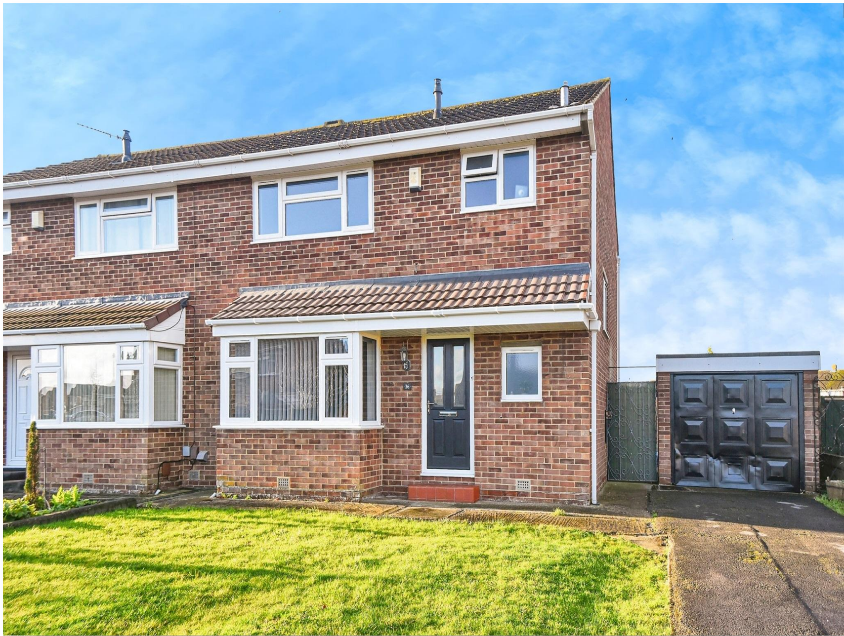
Chalford Avenue, Swindon SN3 3NU